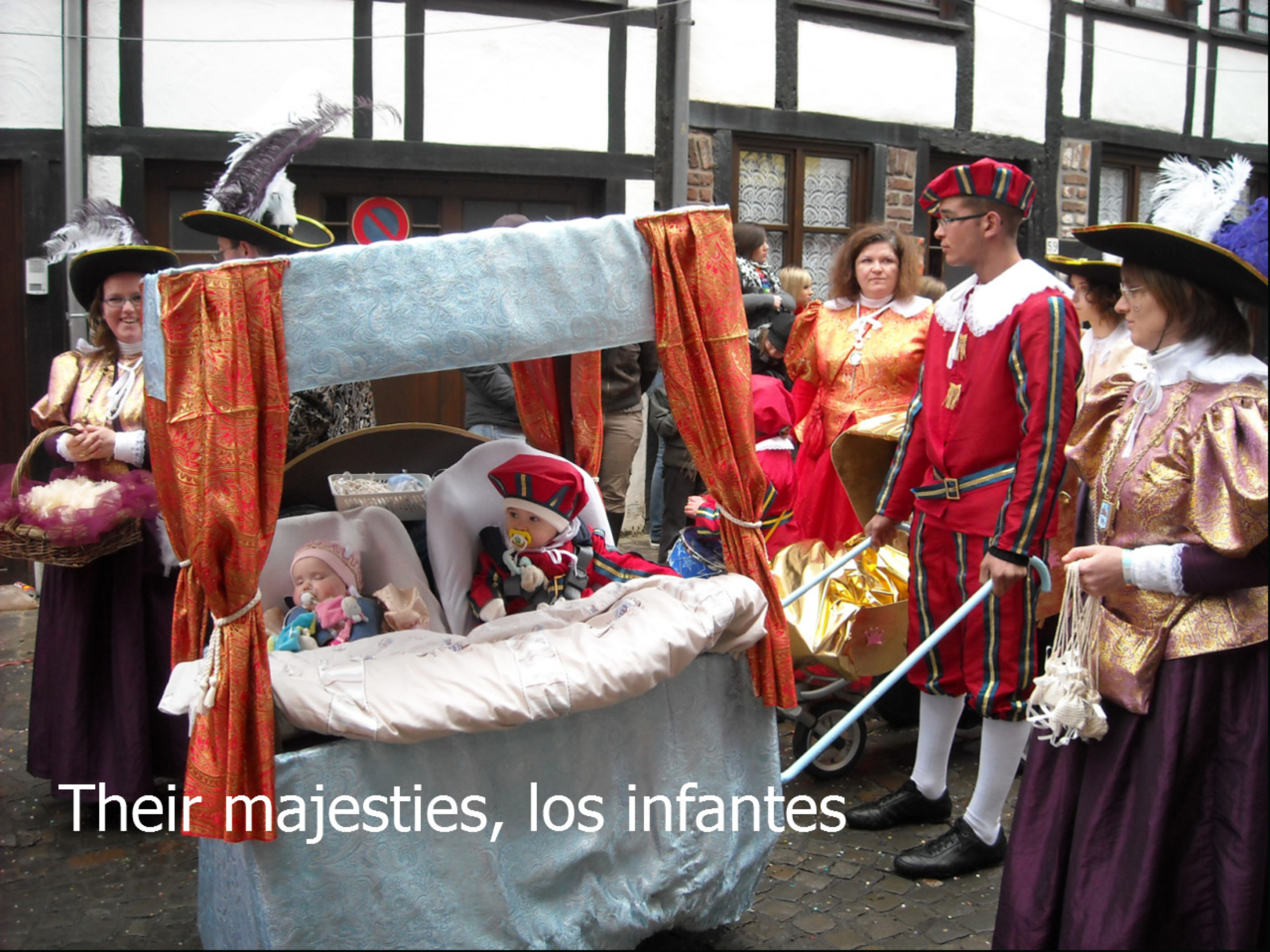
Their majesties, los infantes