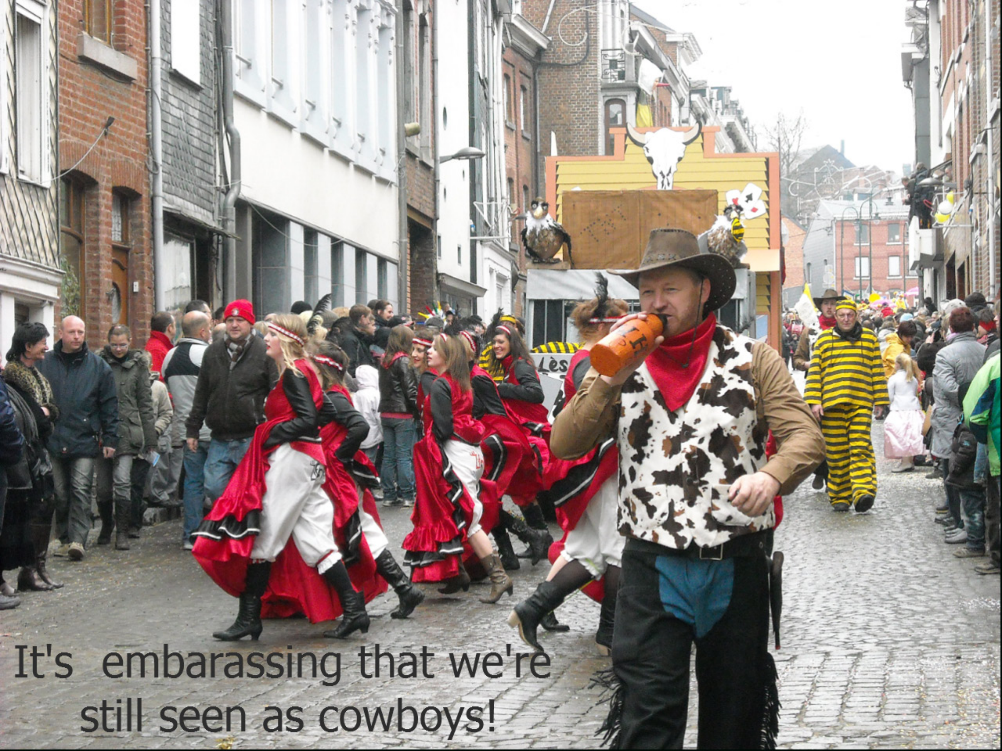
It's embarrassing that we're still seen as cowboys!