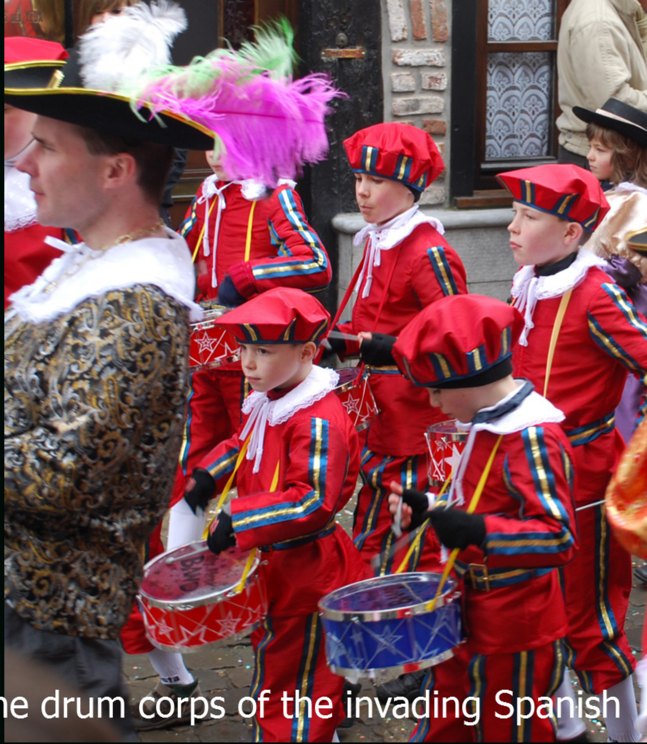
The drum corps of the invading Spanish