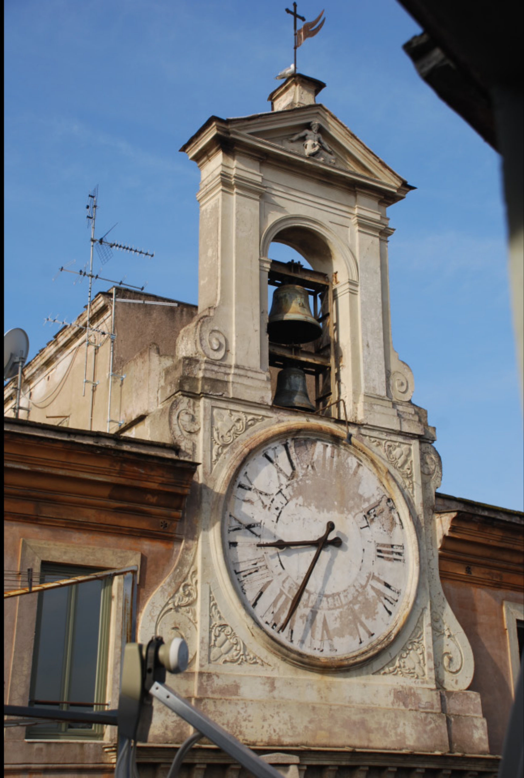
and our clock tower