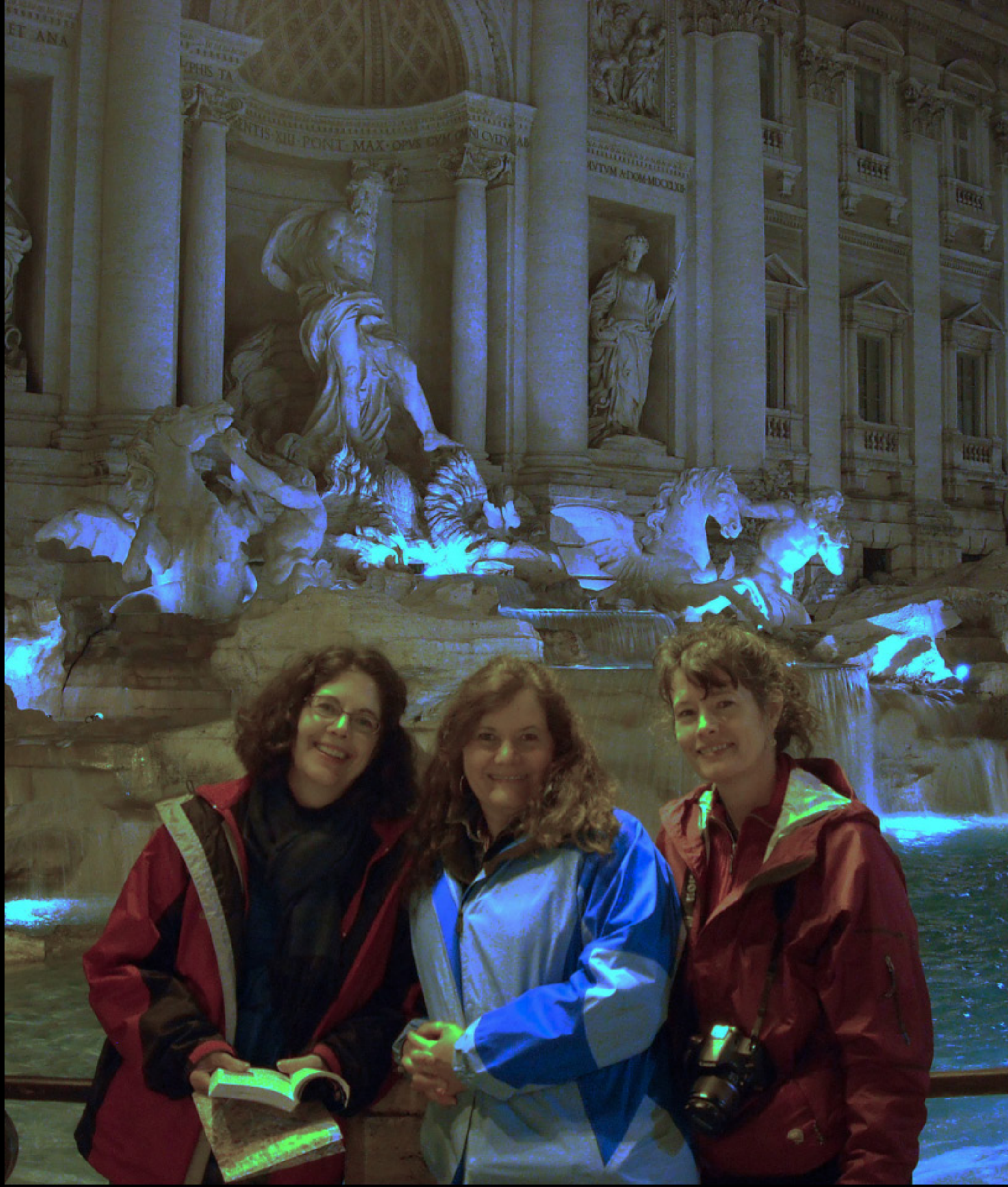
the three sisters at the Trevi fountain