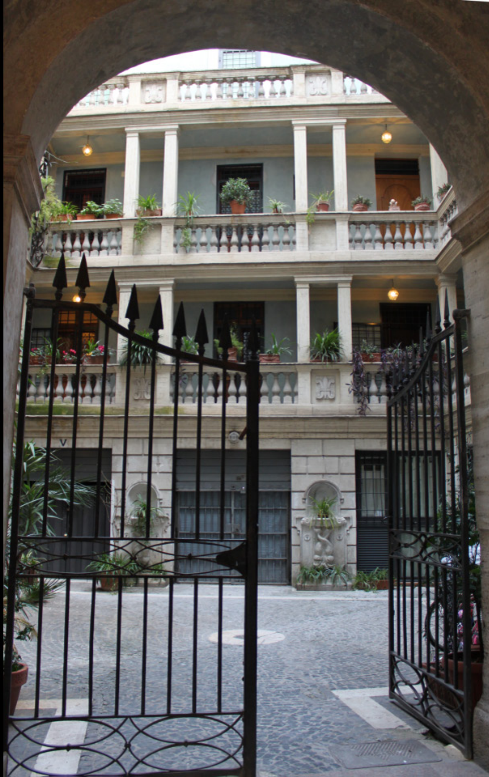
The inner gate