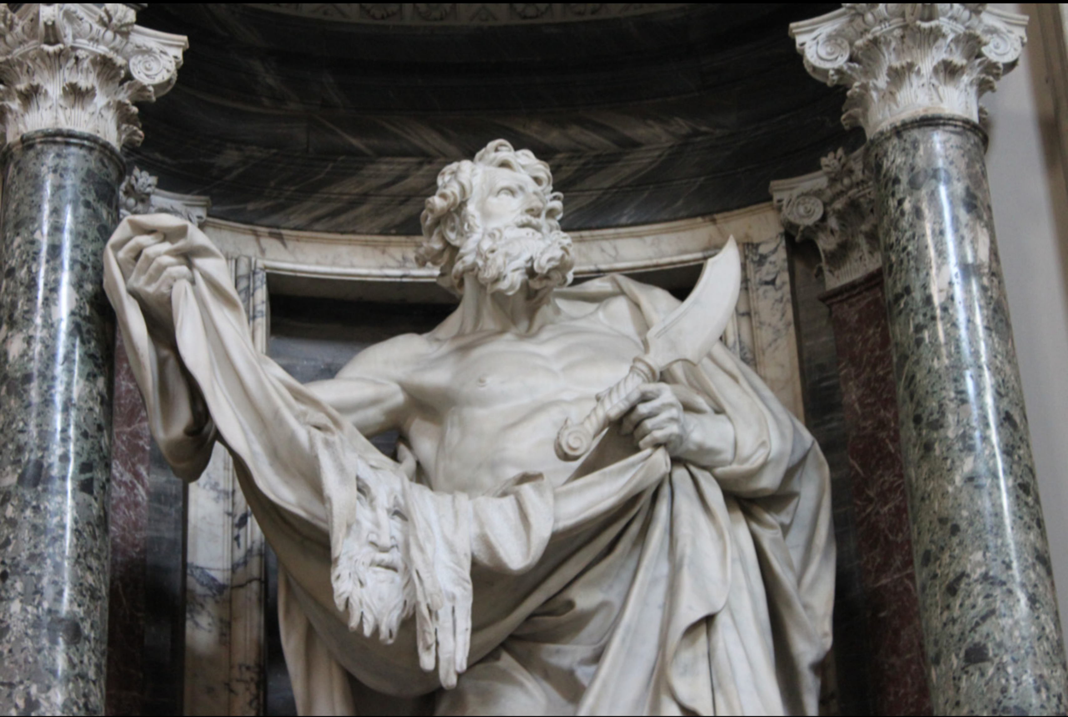
(a flayed saint holding his skin)