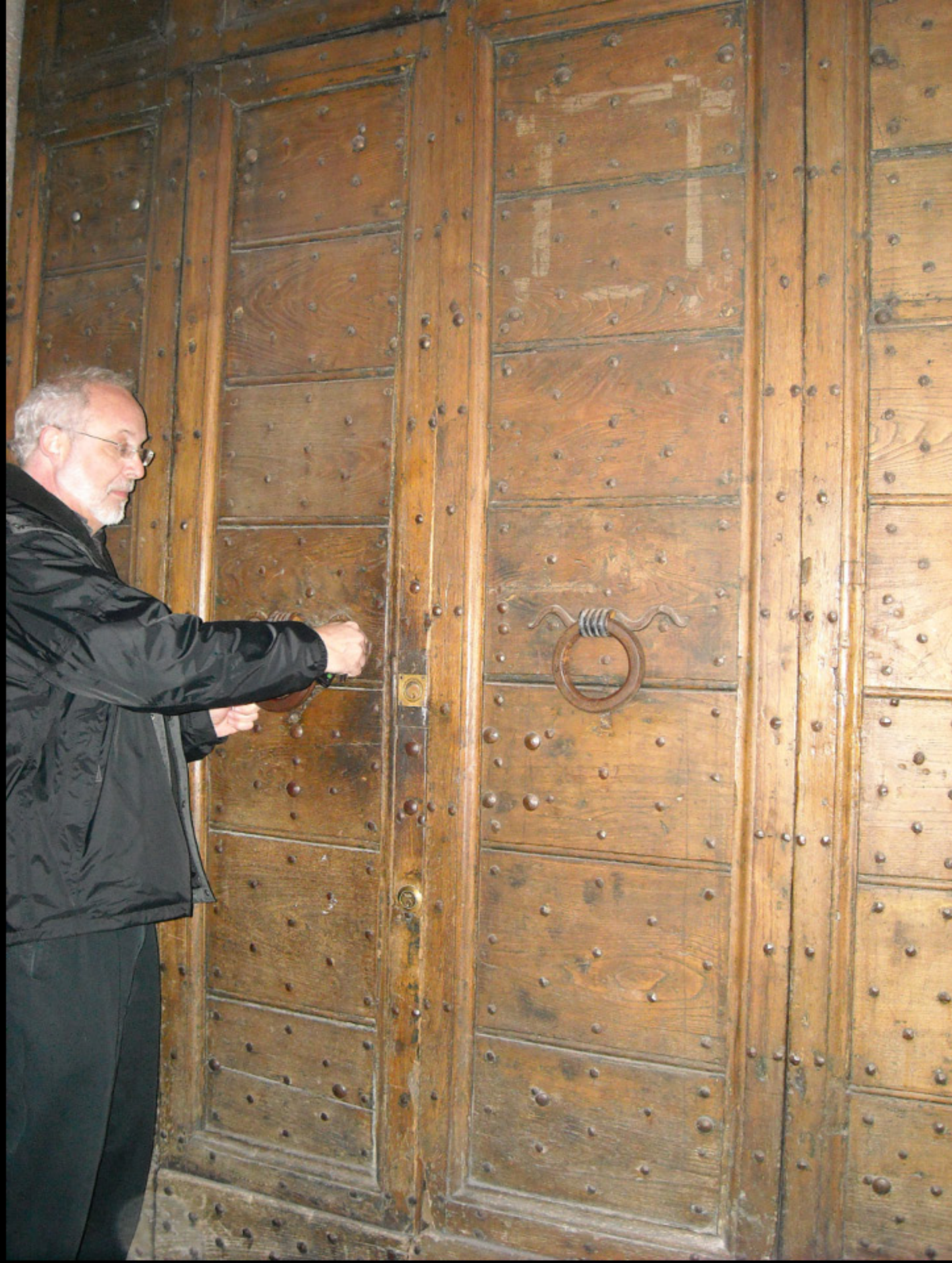
The front door