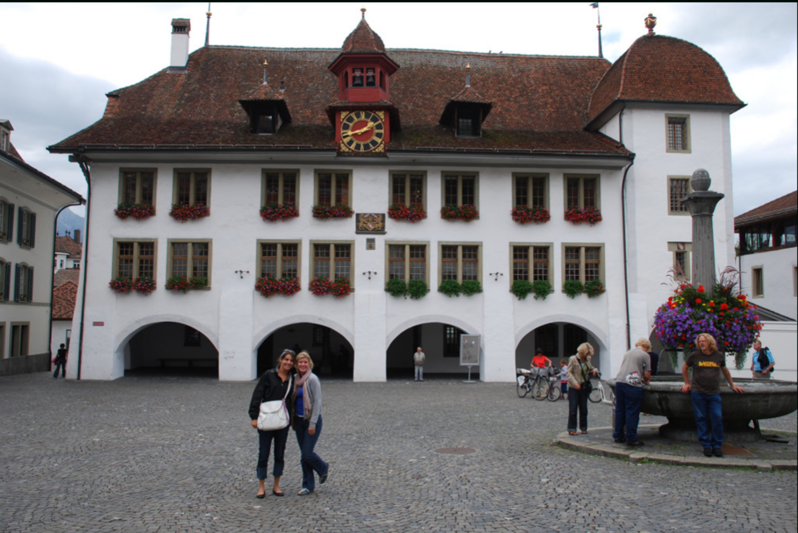
The town hall from the market square