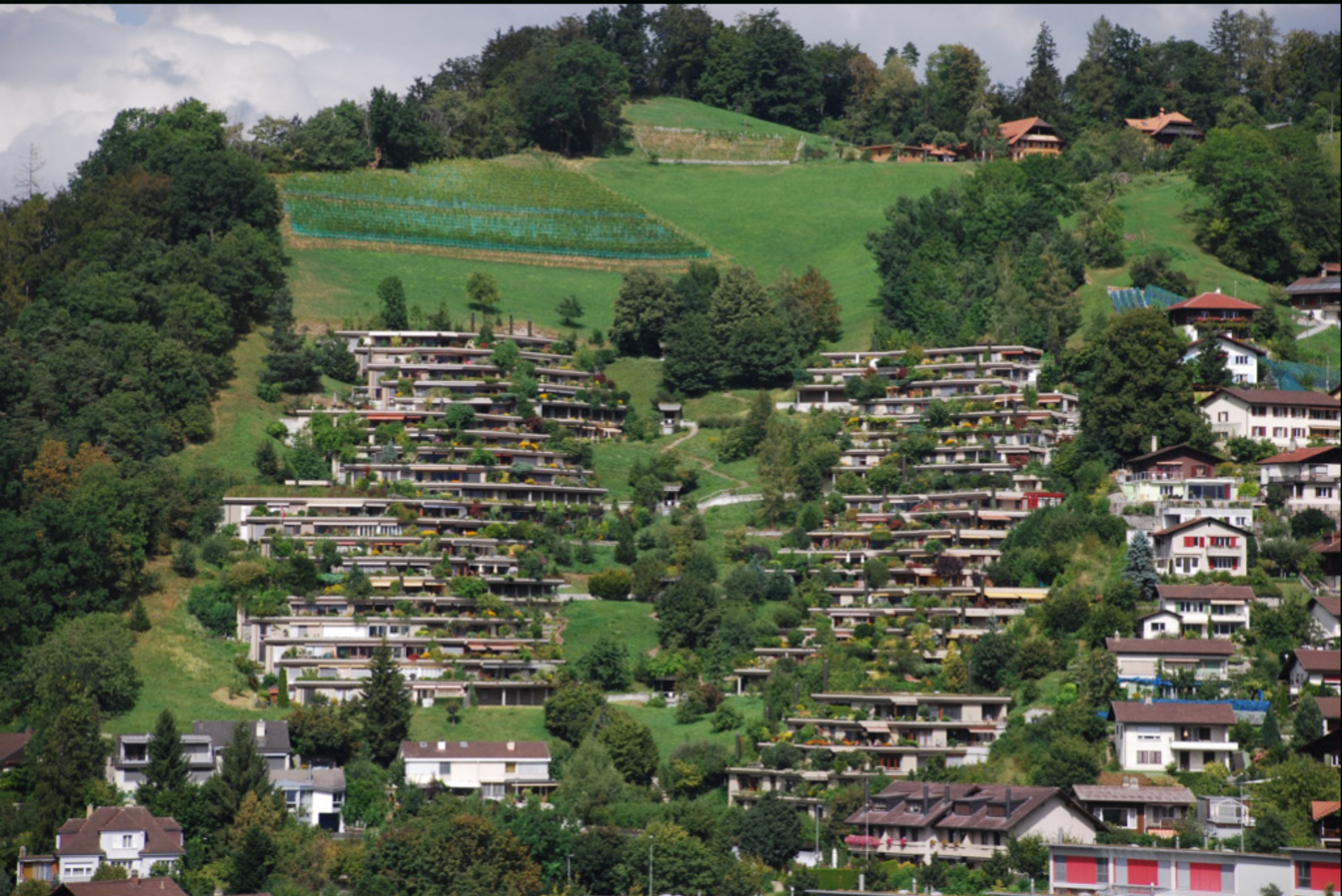
Environmentally friendly housing