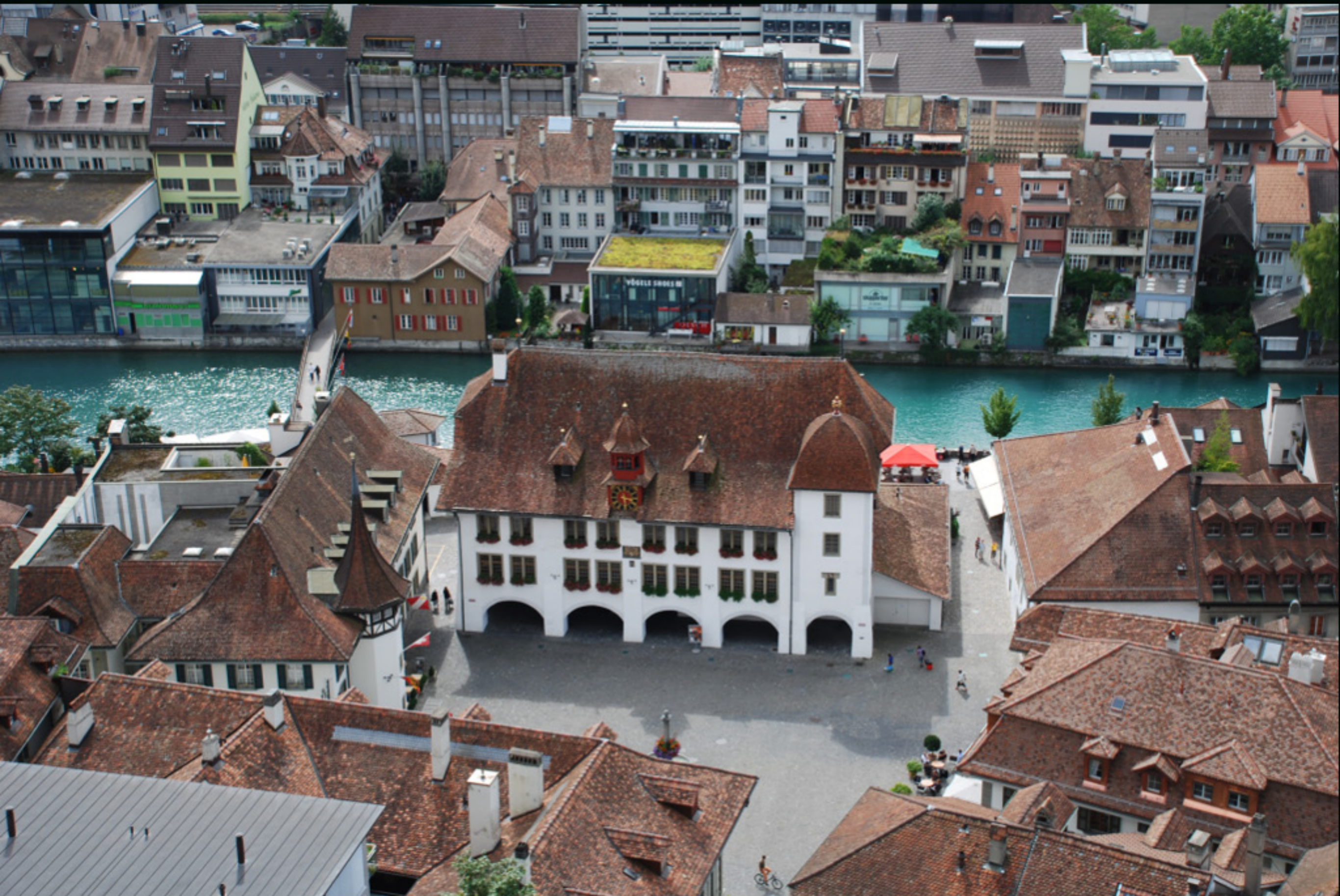
The town hall and market square