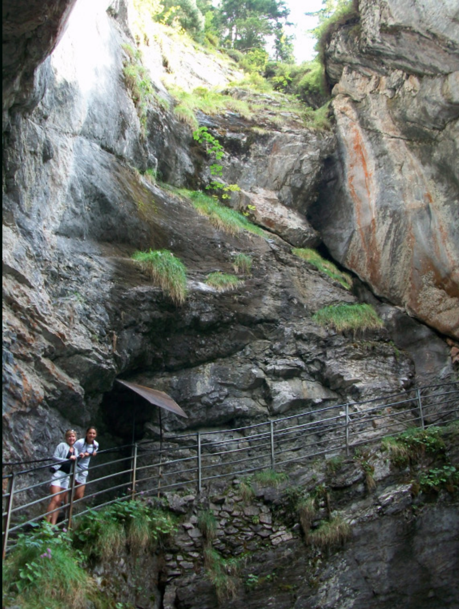
The outside part of Trummelbach Falls