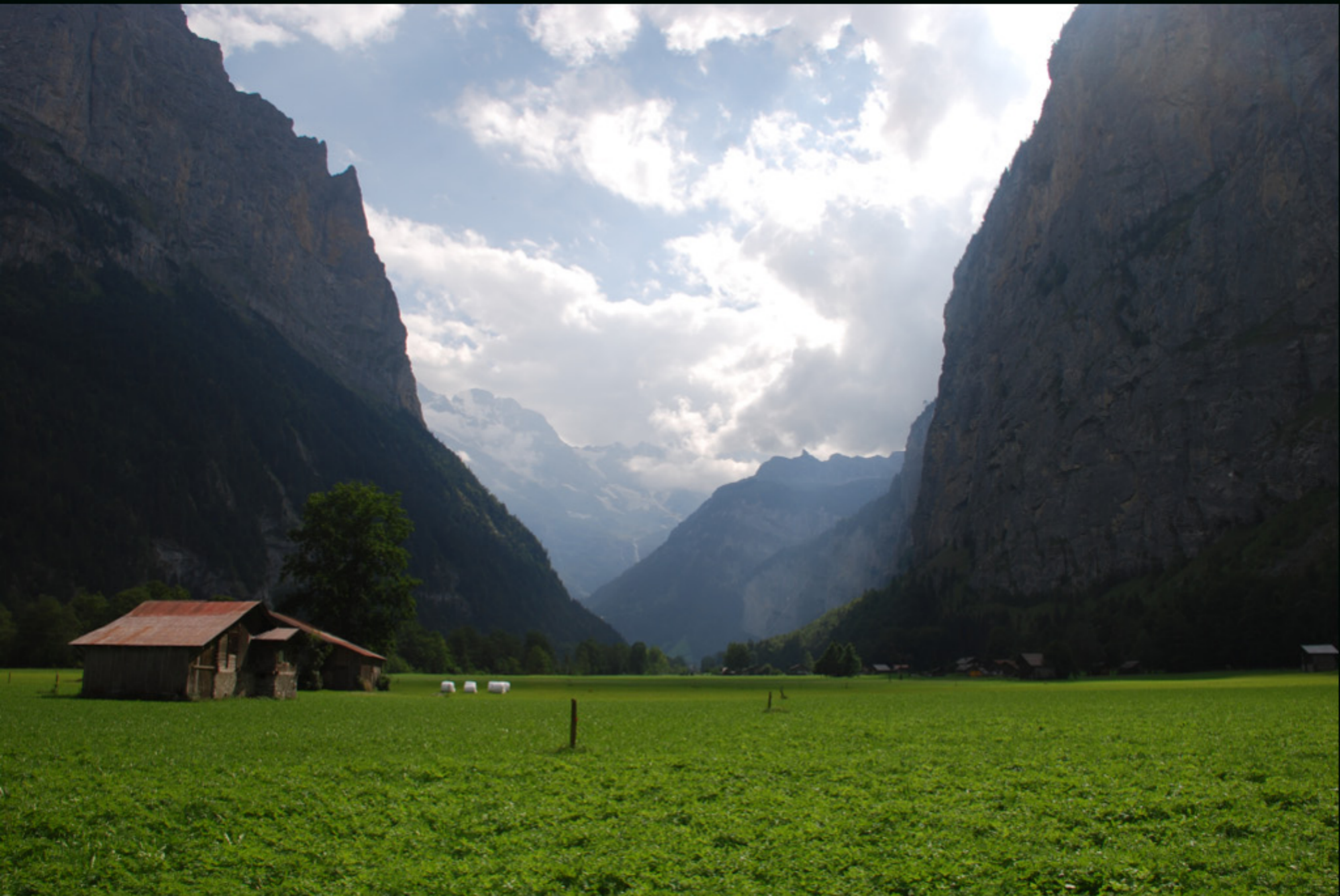
Looking back up the valley