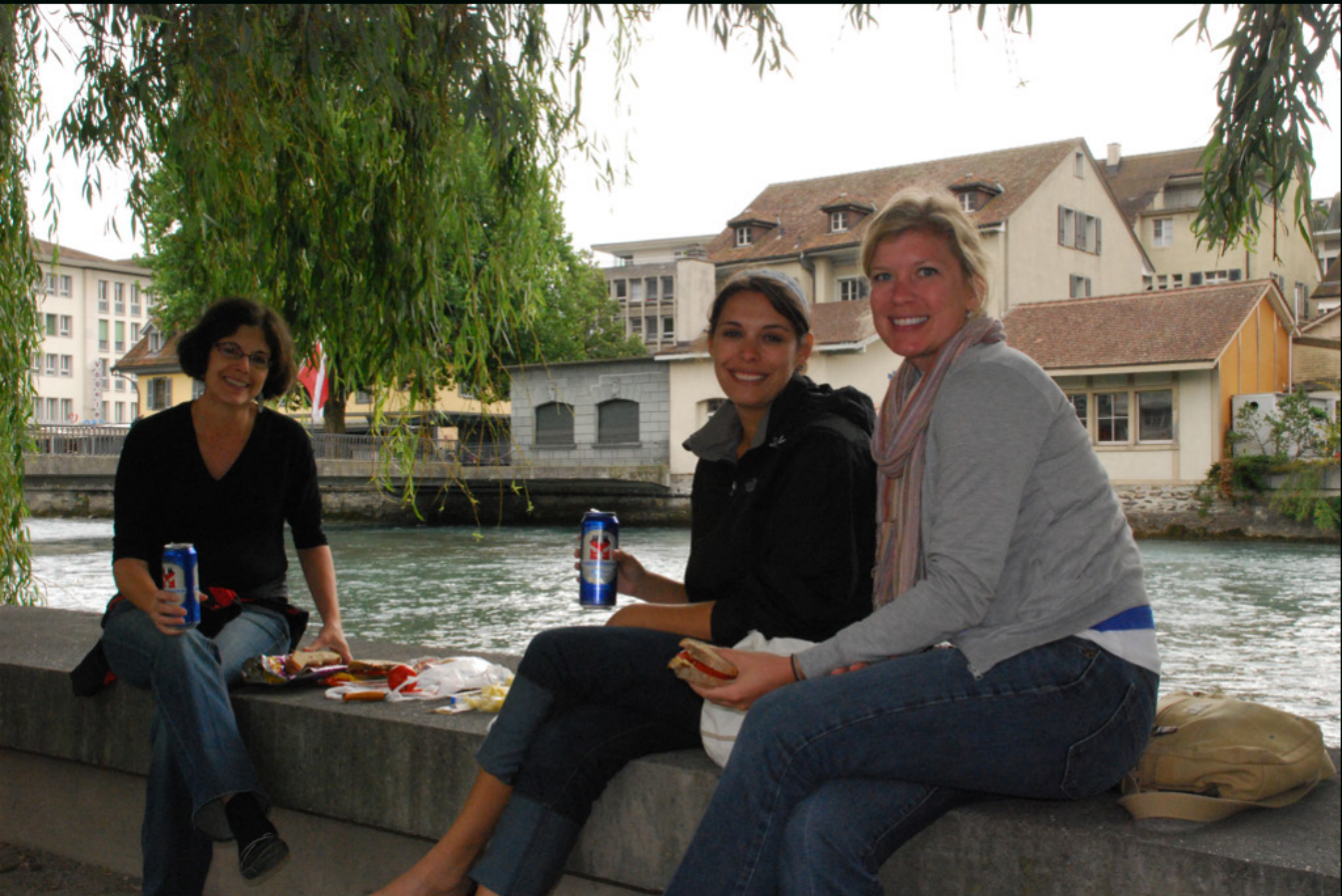
Our last picnic of the trip