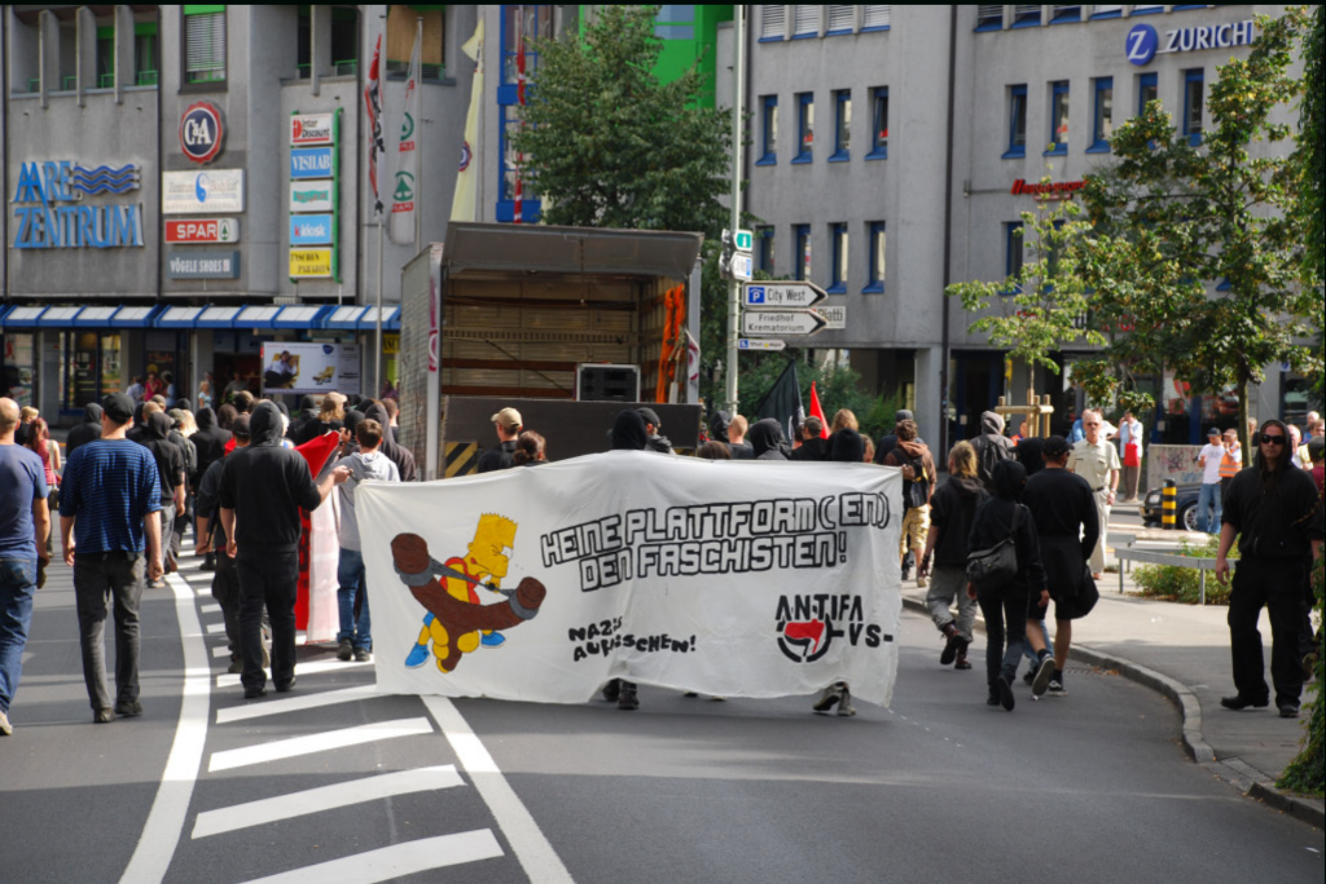
Apparently not everyone is happy with the Swiss government