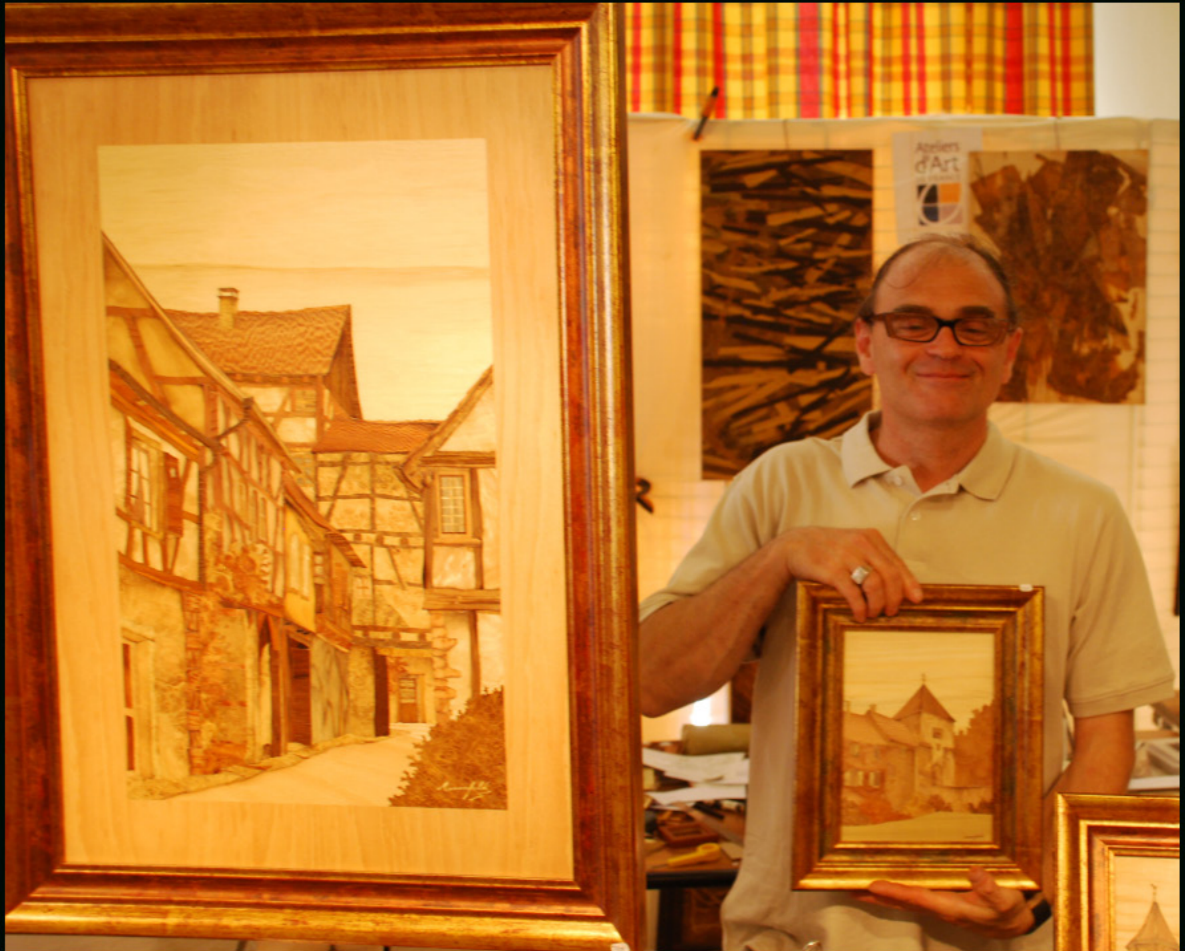
The artist and his works in woods