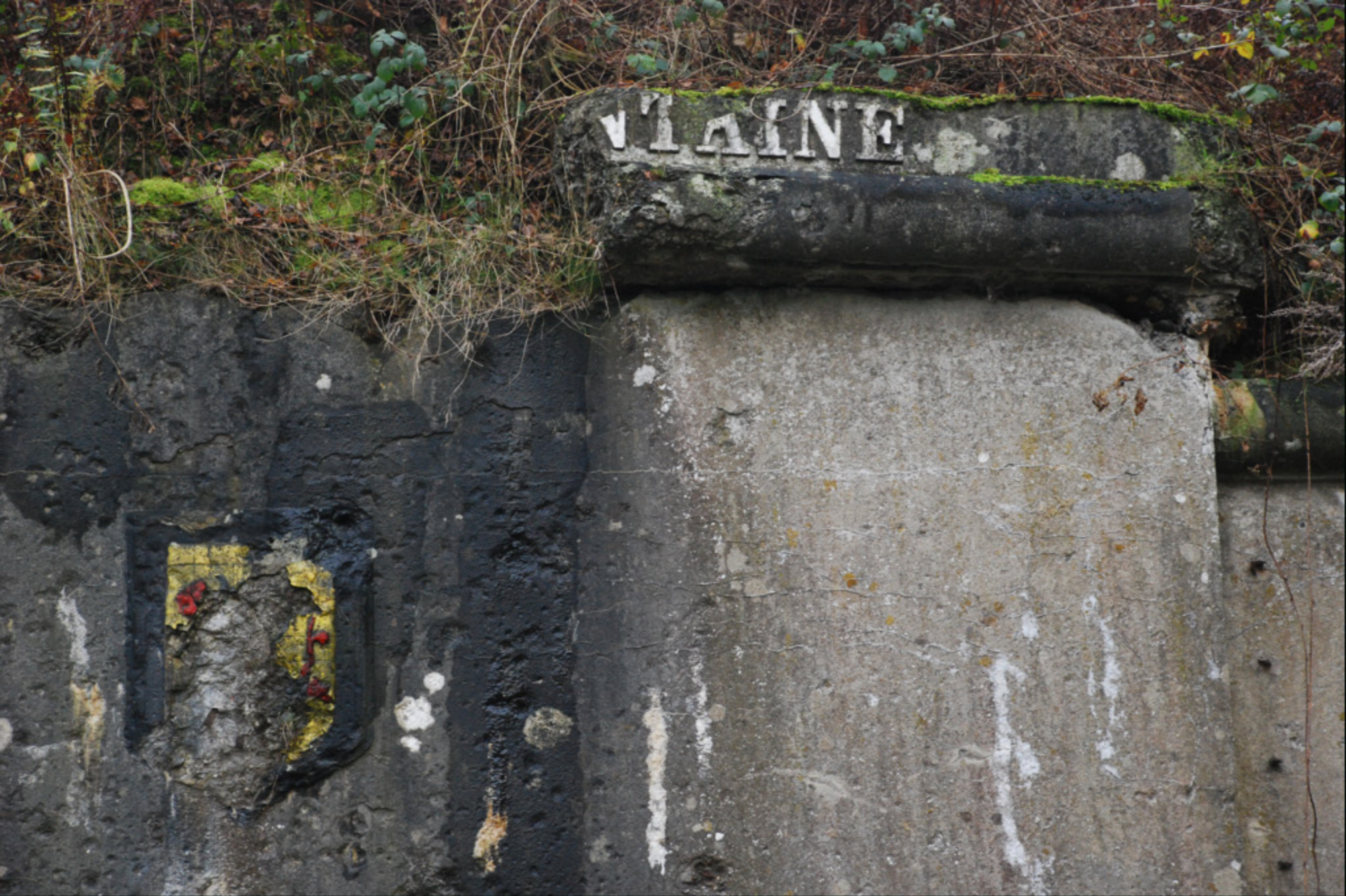
The battered entrance to the fort at Chaudfontain