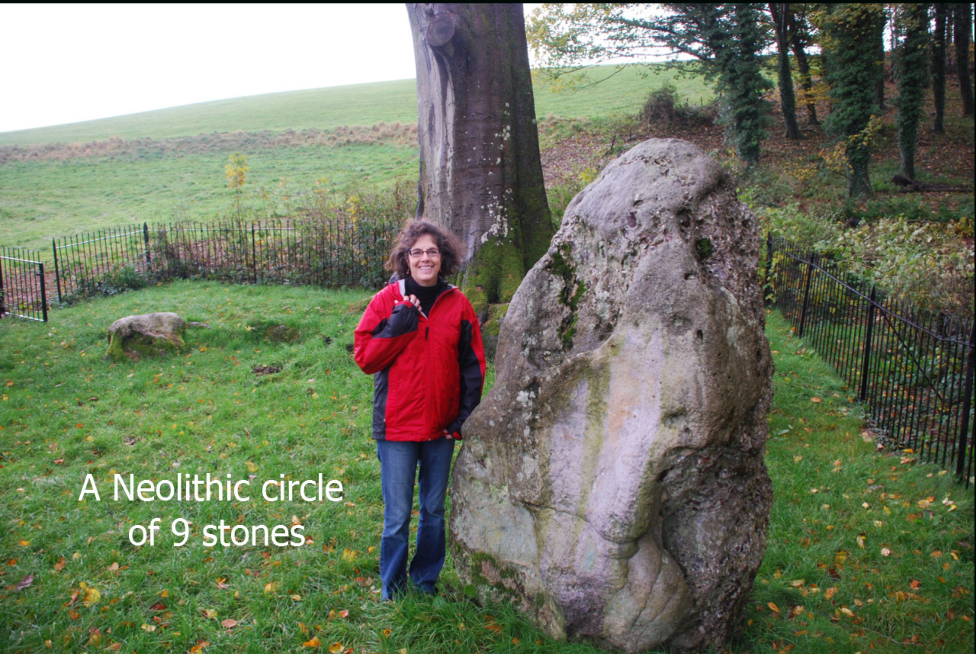
A Neolithic circle of 9 stones