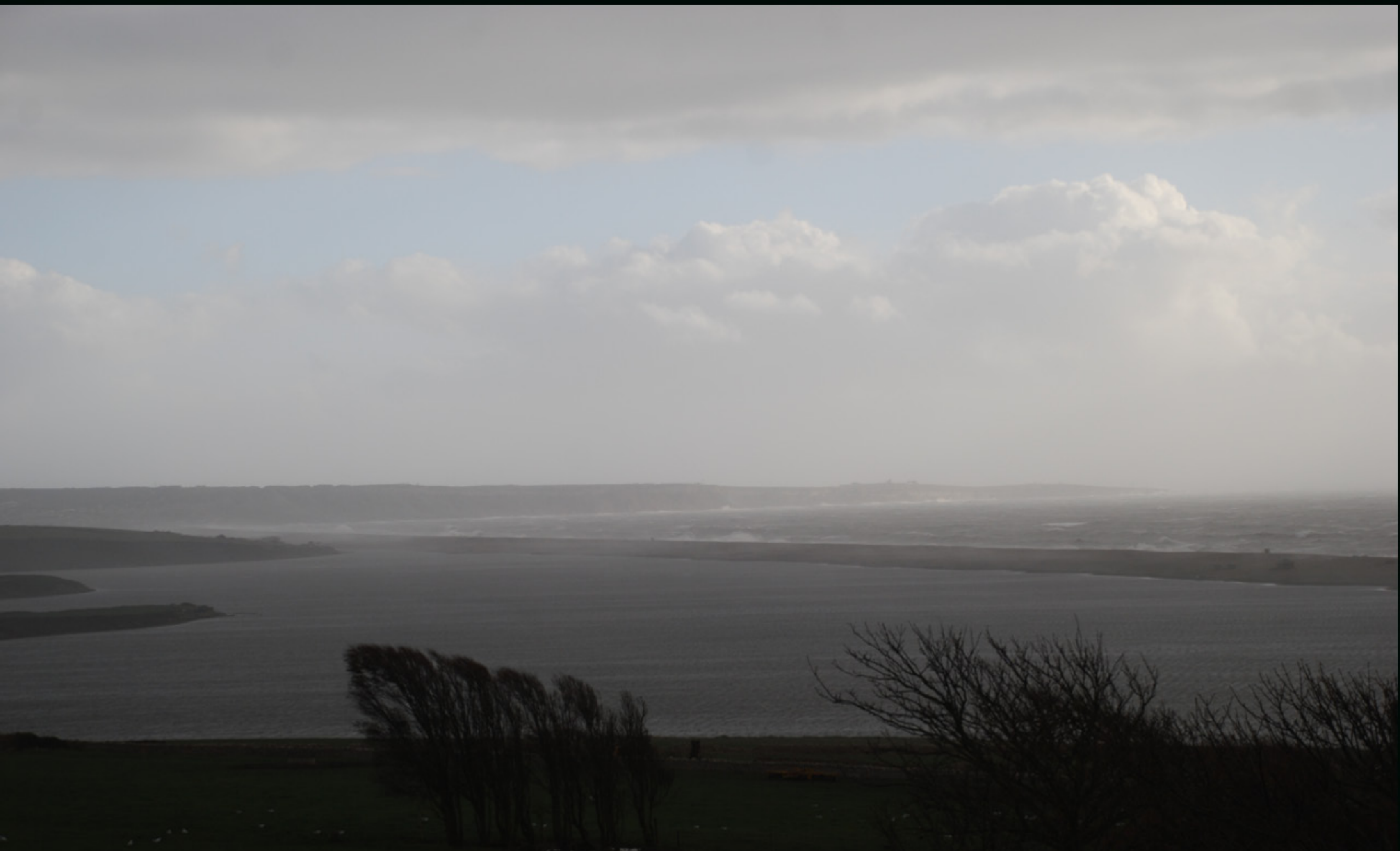
Chesil Beach, at the east end of the Jurassic Coast