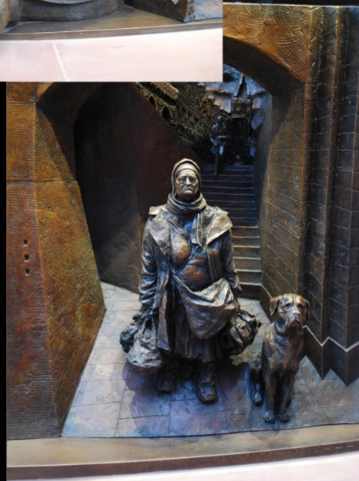
Details on the base of the couple