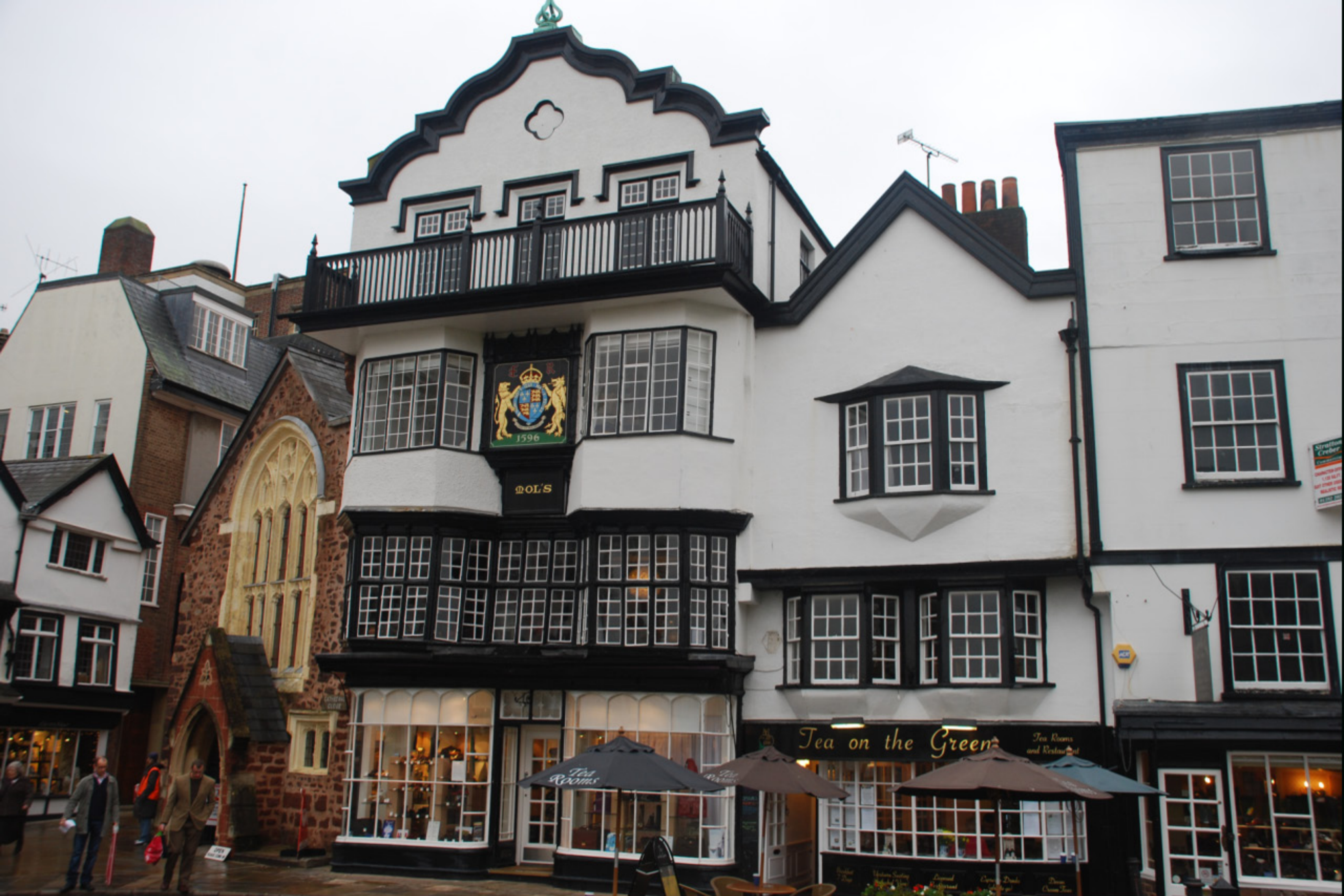
15th Century Mol's Tea House dwarfs St. Martin's church built in 1065