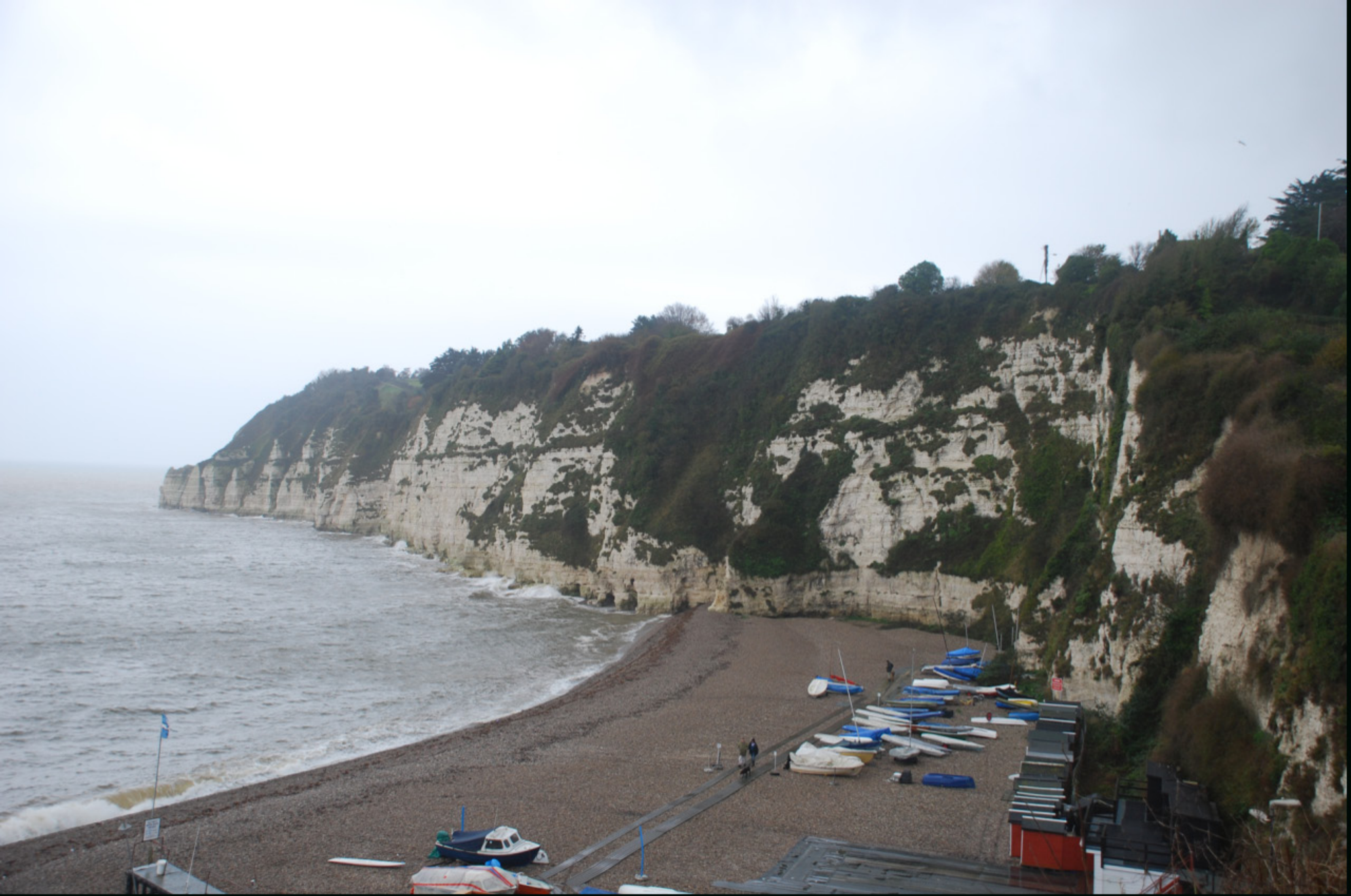
The tiny harbor of Beer surrounded by chalk cliffs