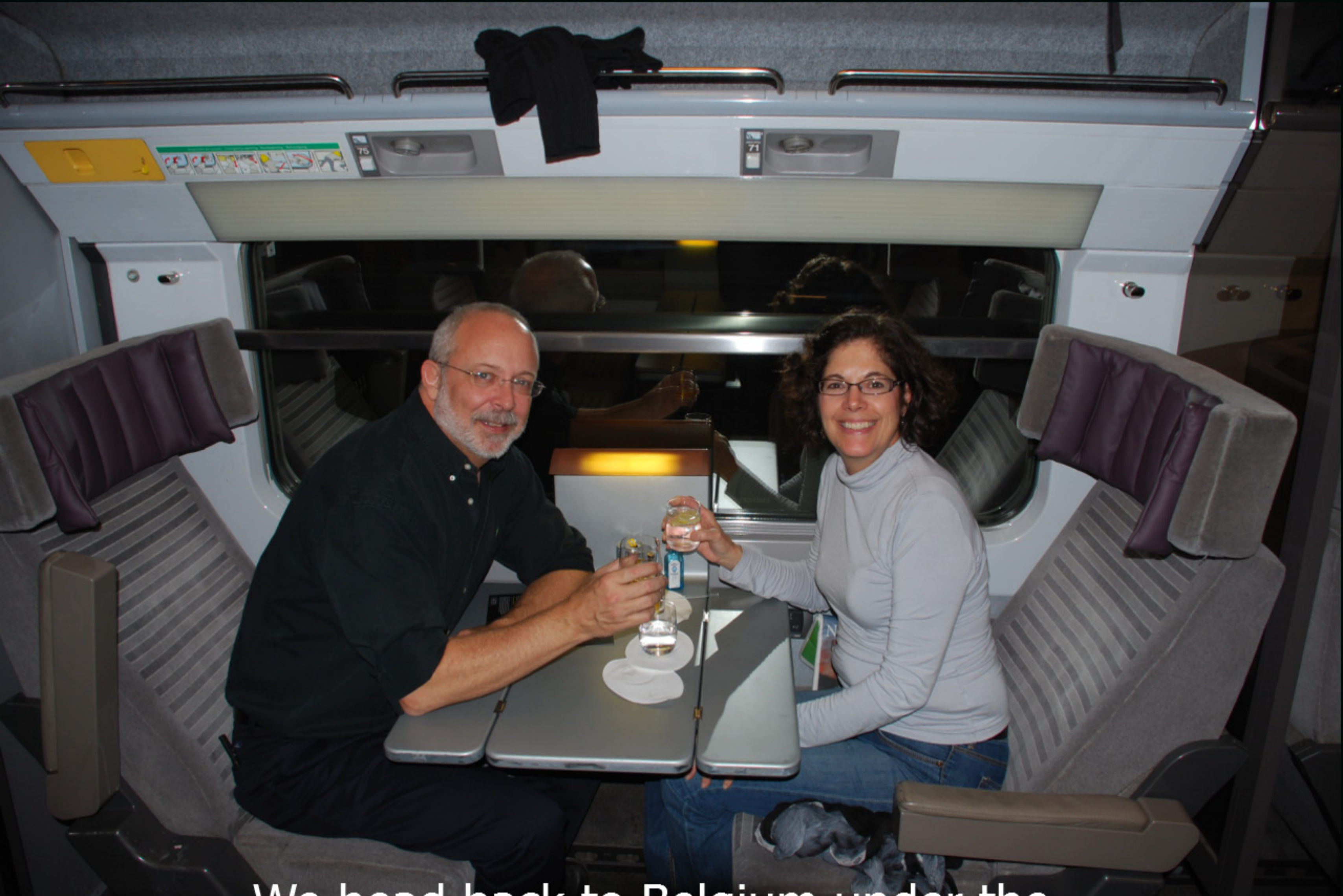
We head back to Belgium under the Channel