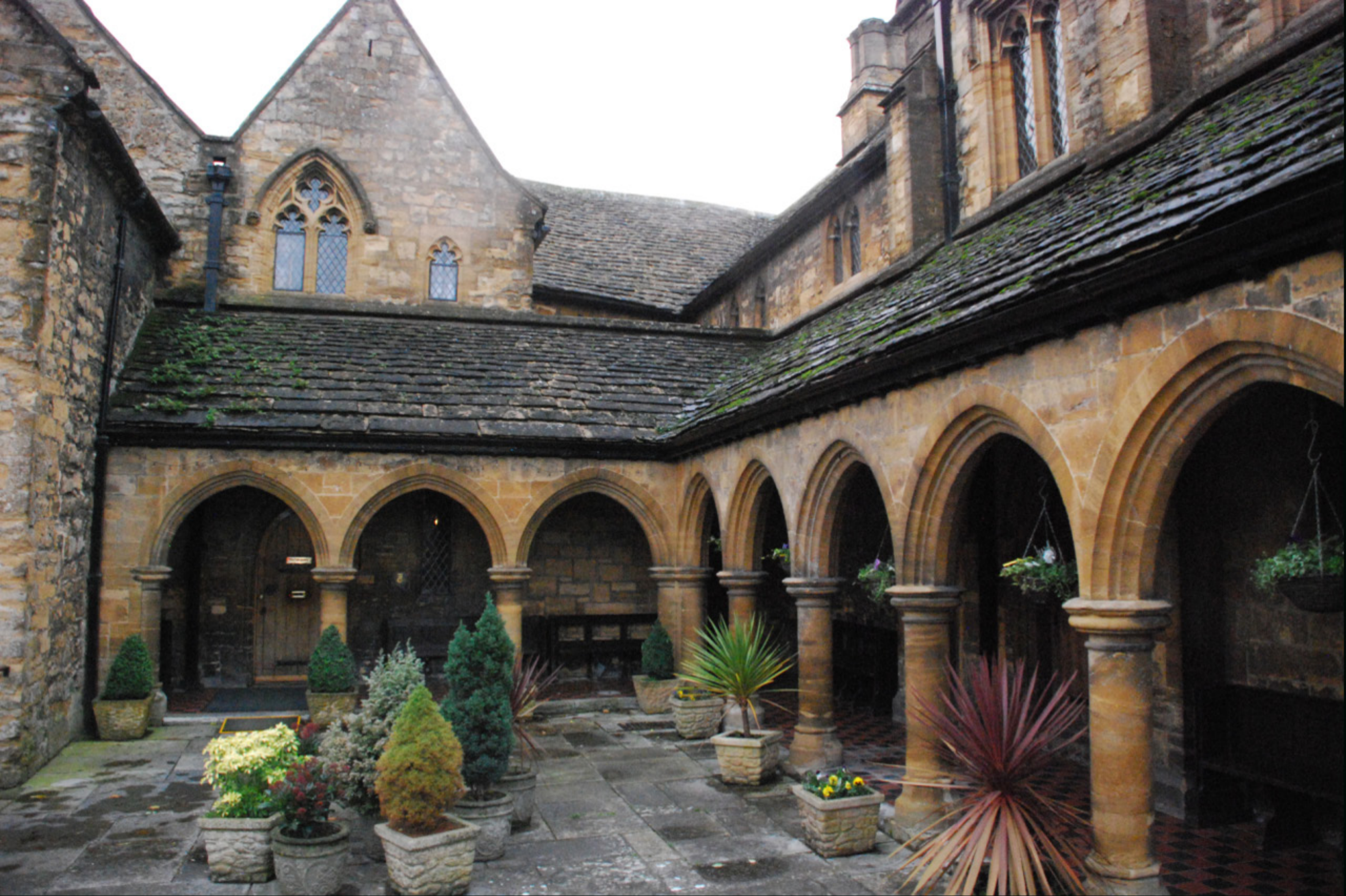
A beautiful cloister near the abbey