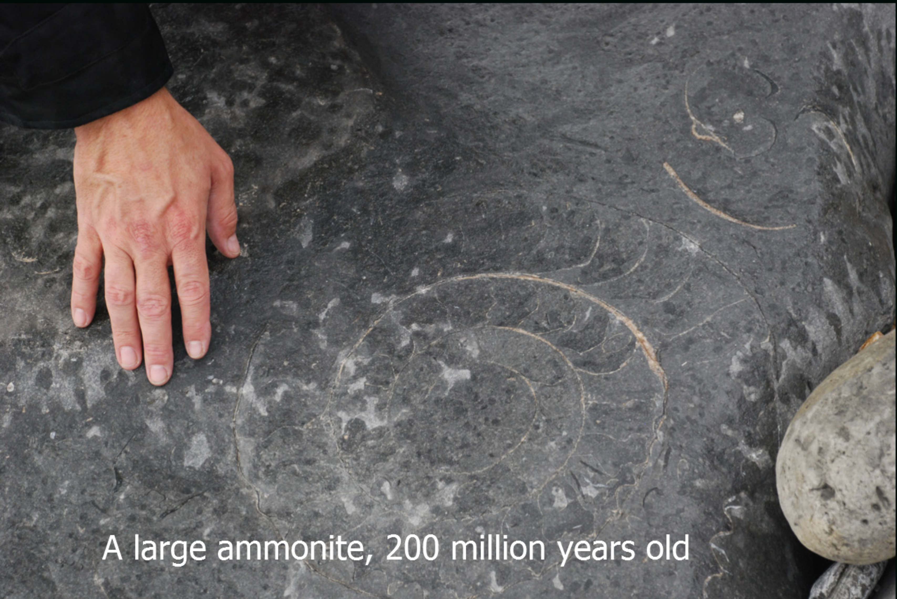
A large ammonite, 200 million years old