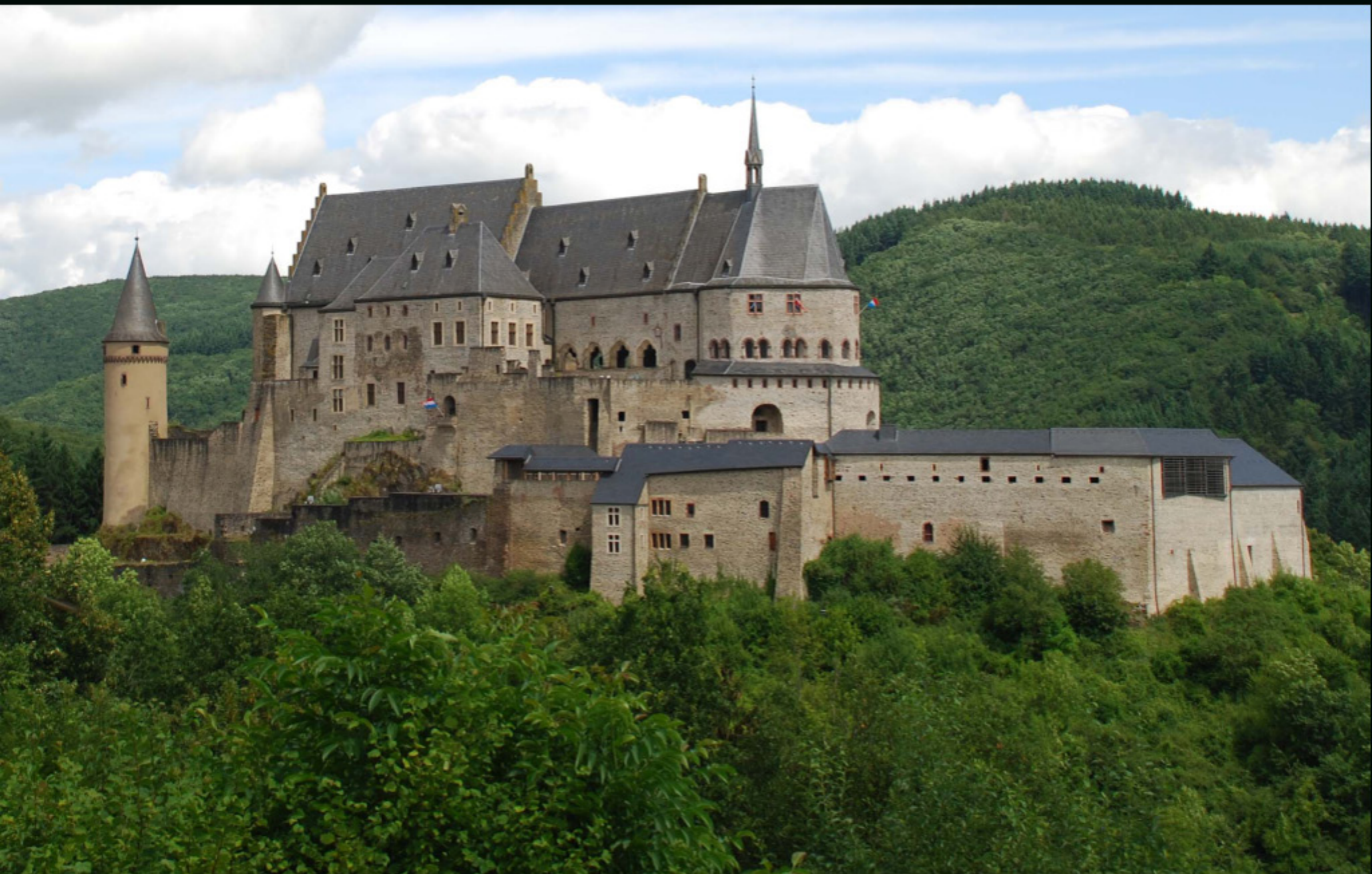
Schloss Vianden, built from the 11th to the 16th centuries