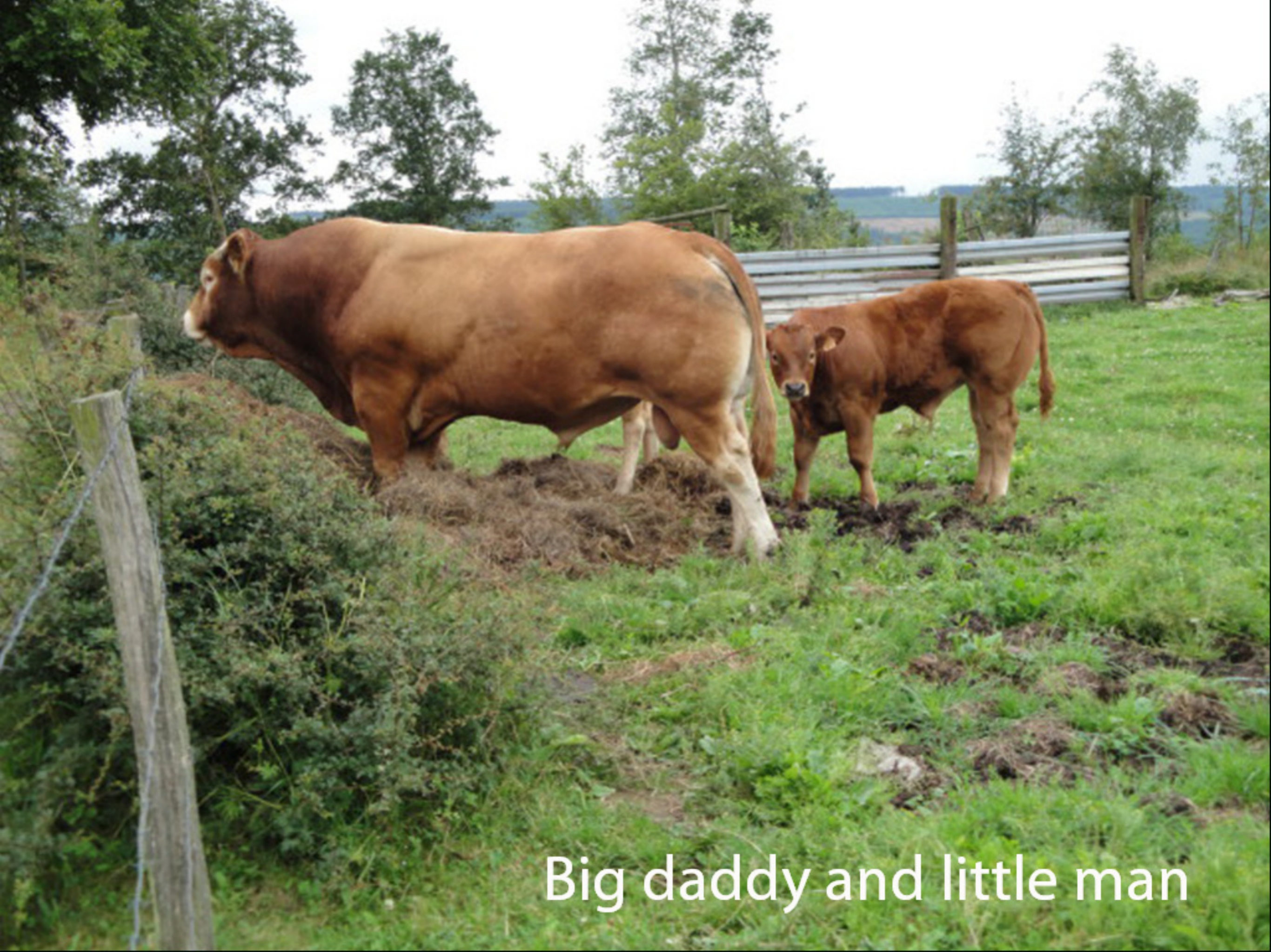
Big daddy and little man