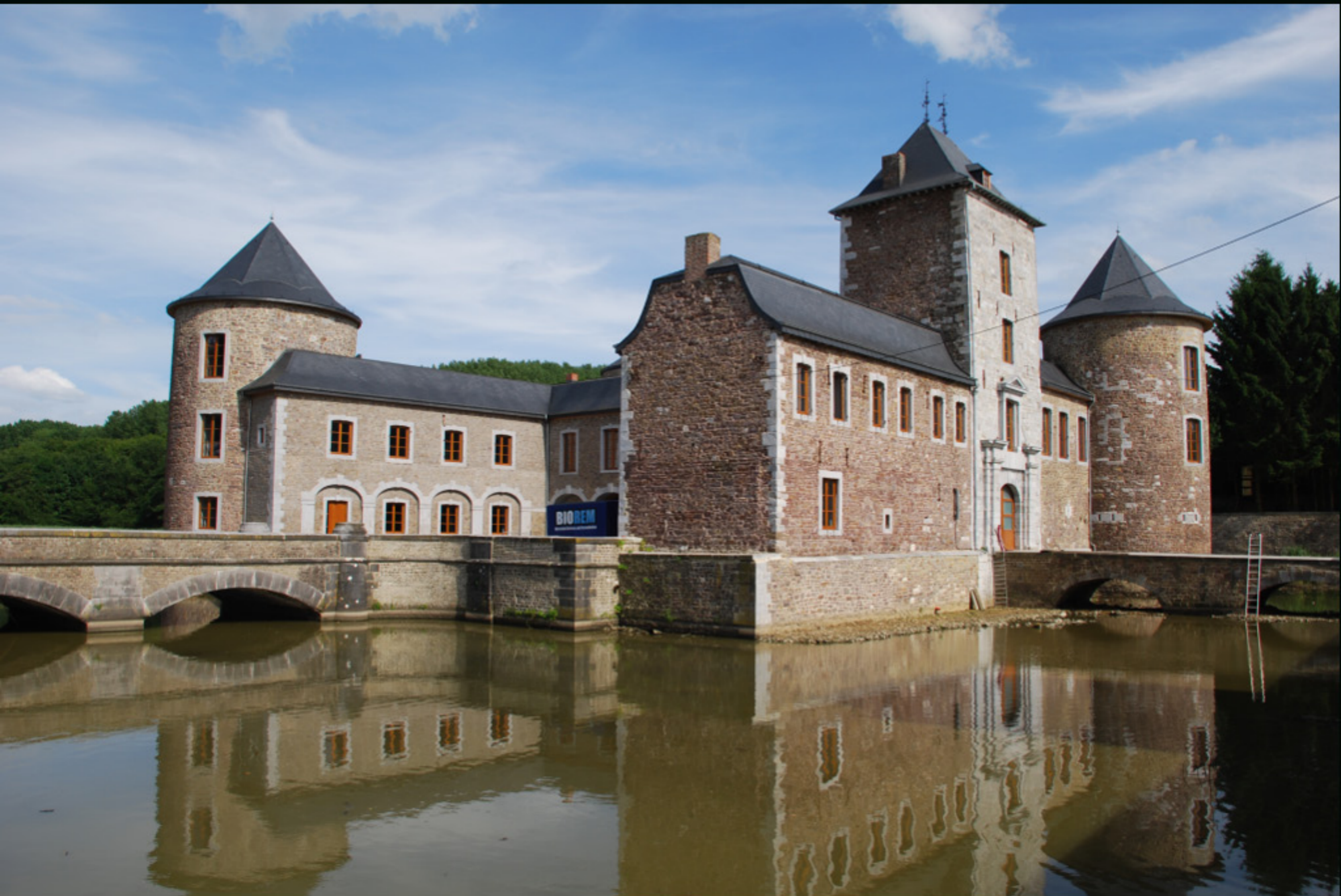
A work in progress, Chateau Neuville