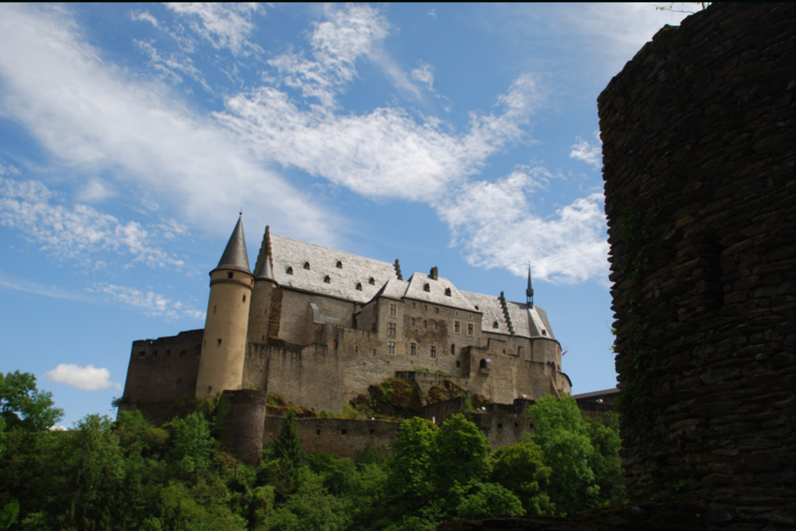
viewed from a tower in the town walls