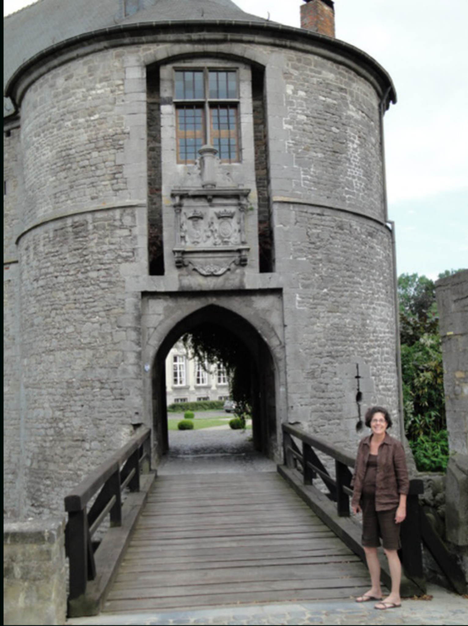
The draw bridge and entry tower