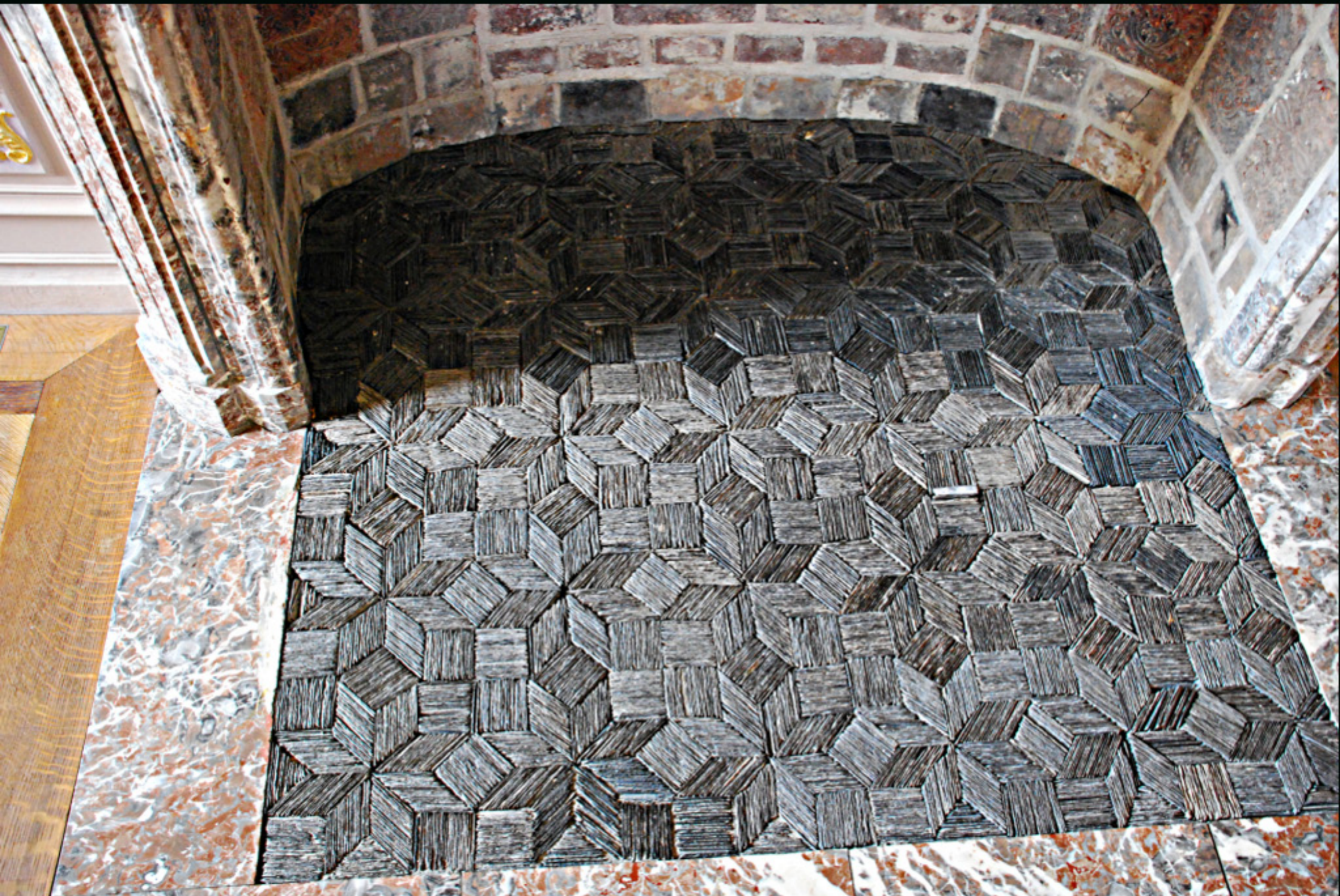
Such an unusual fireplace