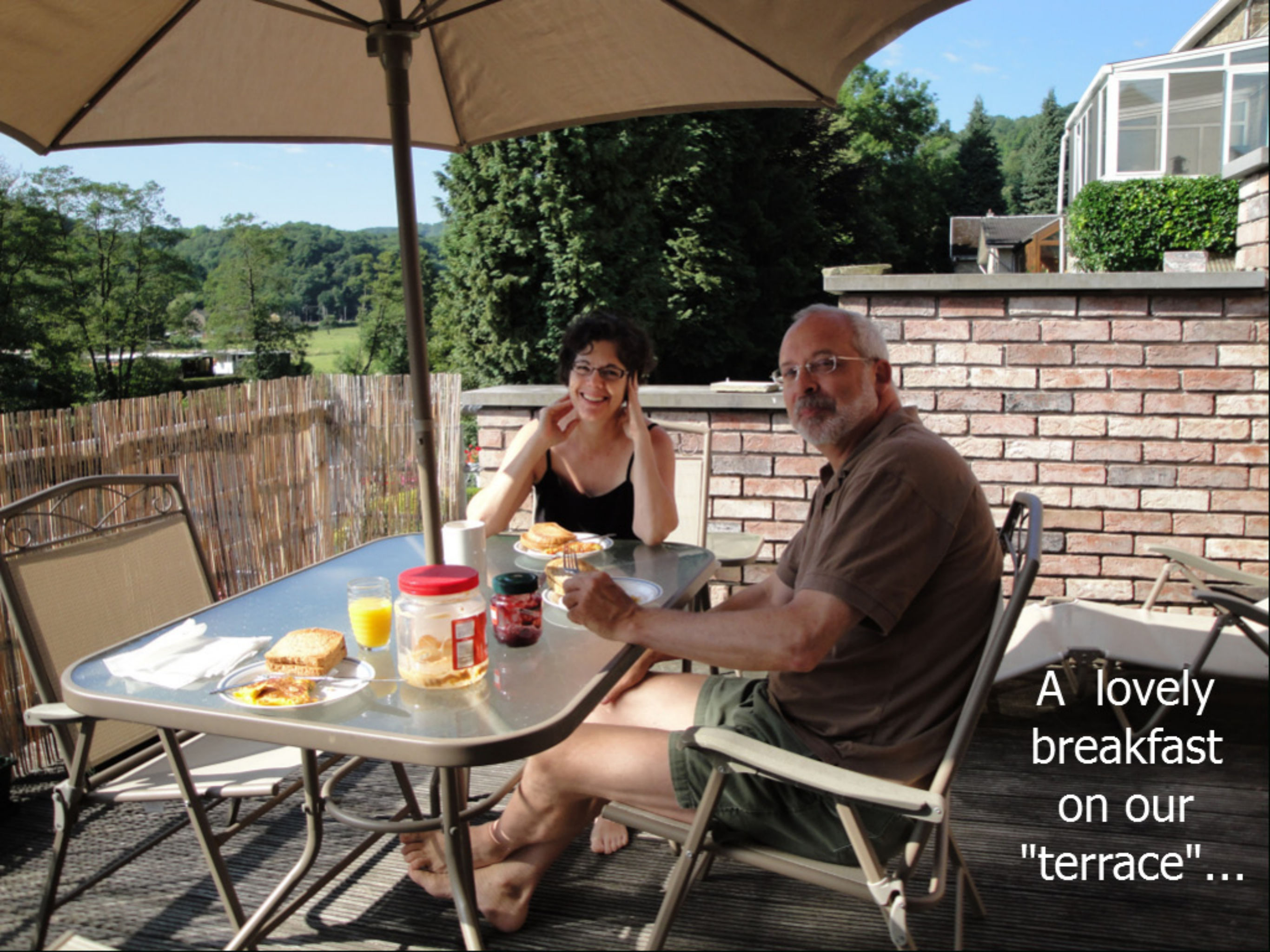
A lovely breakfast on our "terrace"...