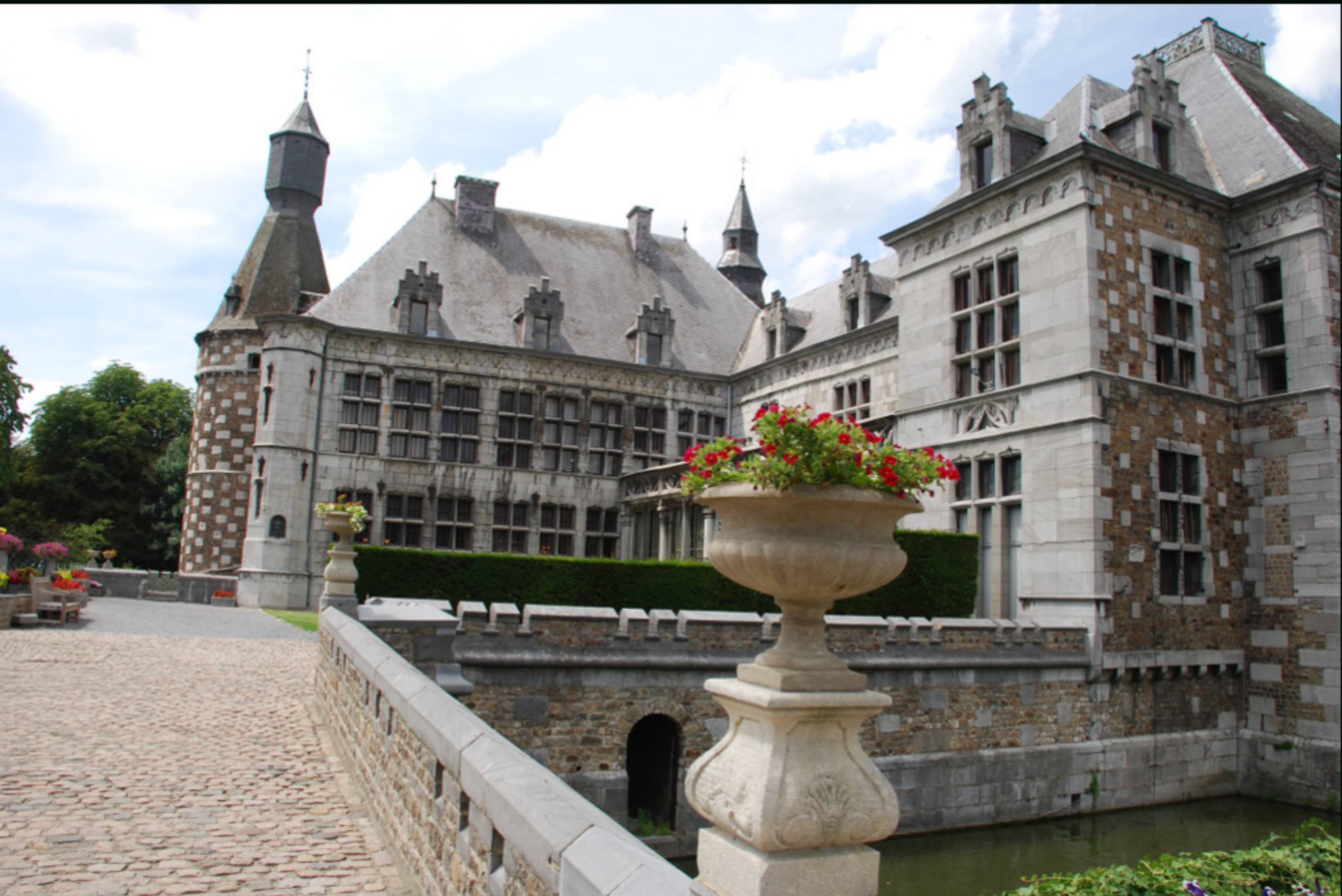
The lovely Chateau Jehay