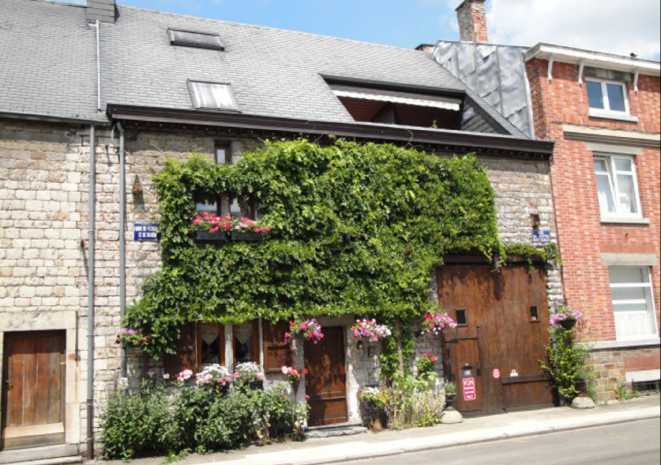
Our walk carried us through the little river village of Hony