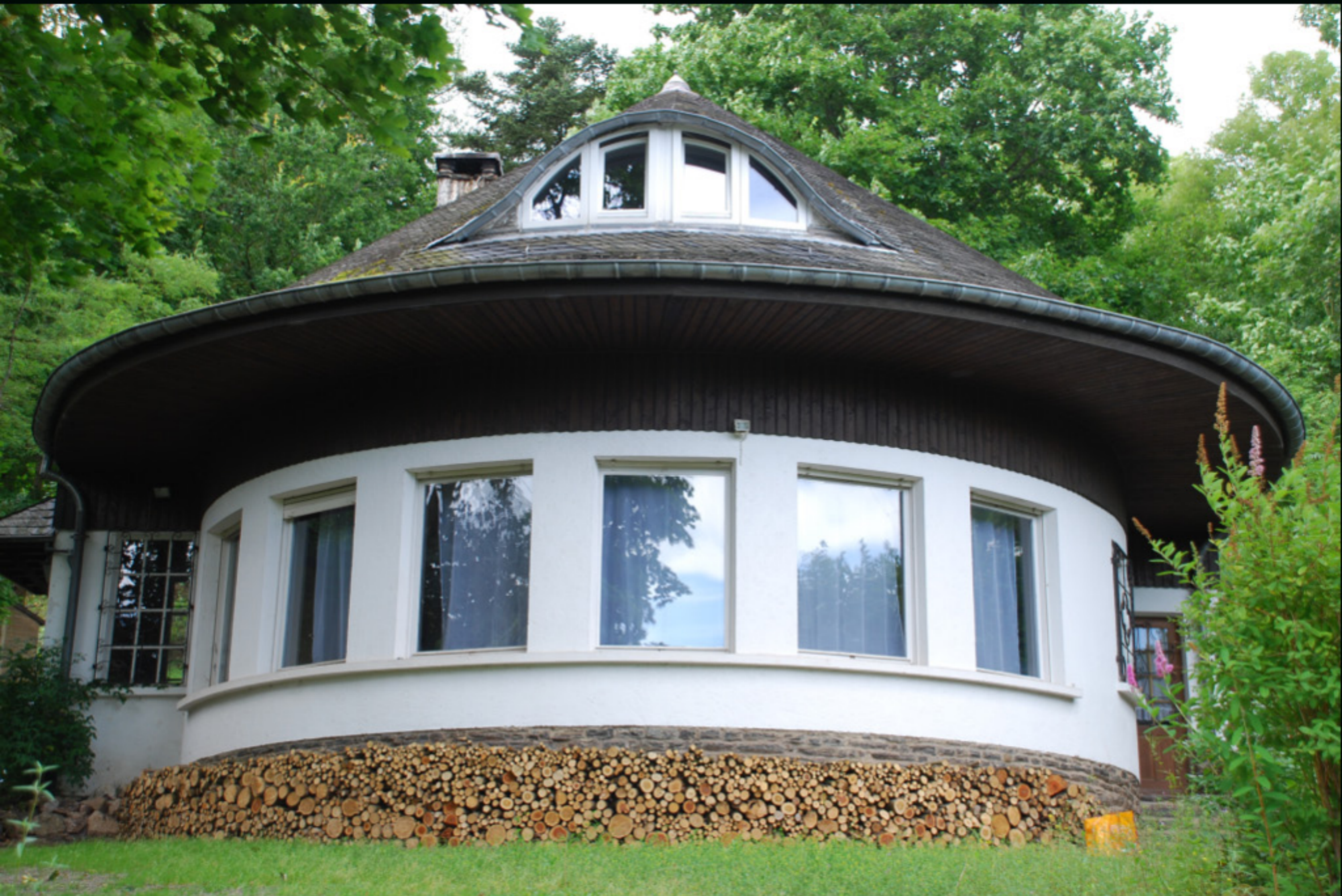
The home of Luxembourggoise hobbits