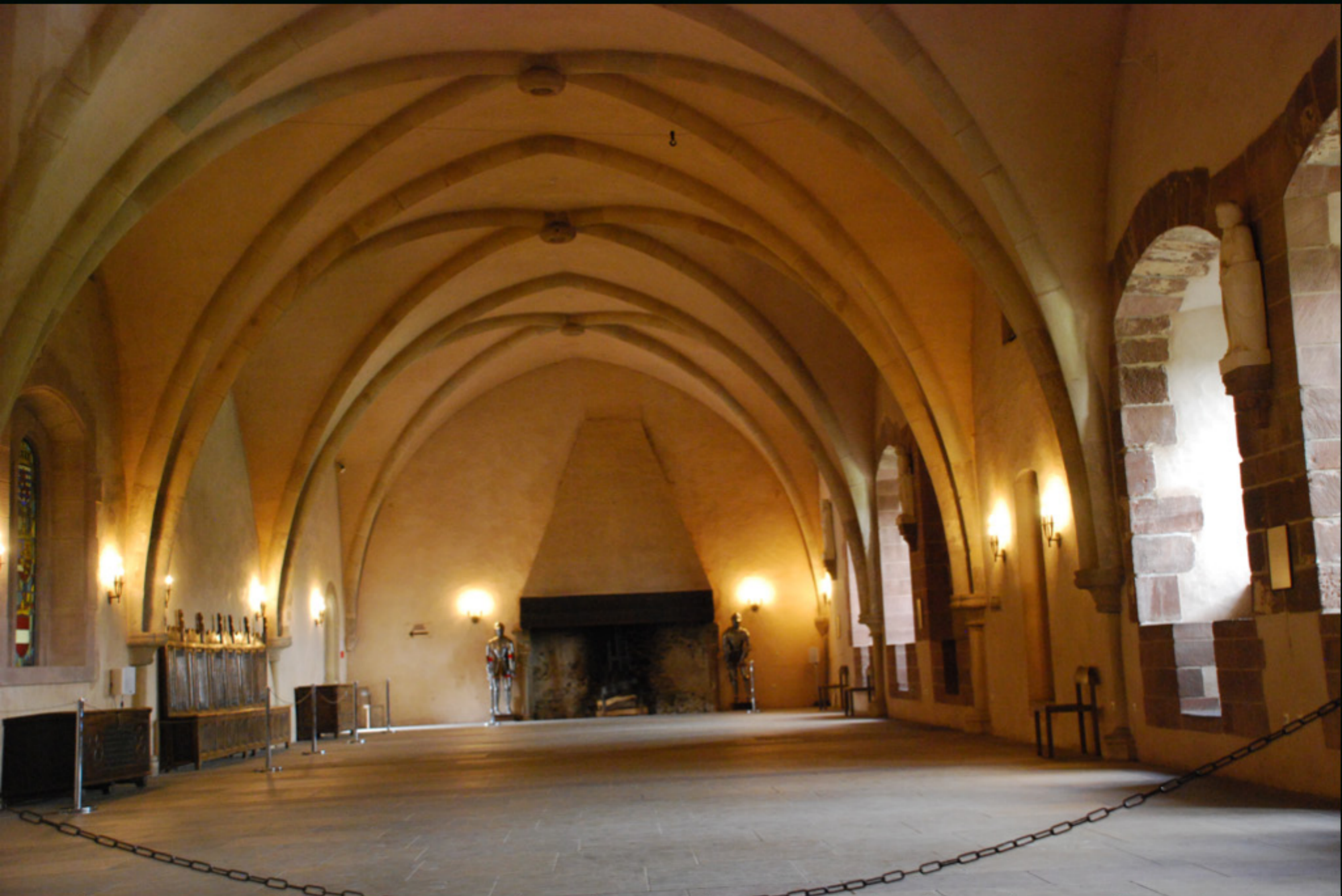
A fantastically recreated gallery that overlooks the valley below