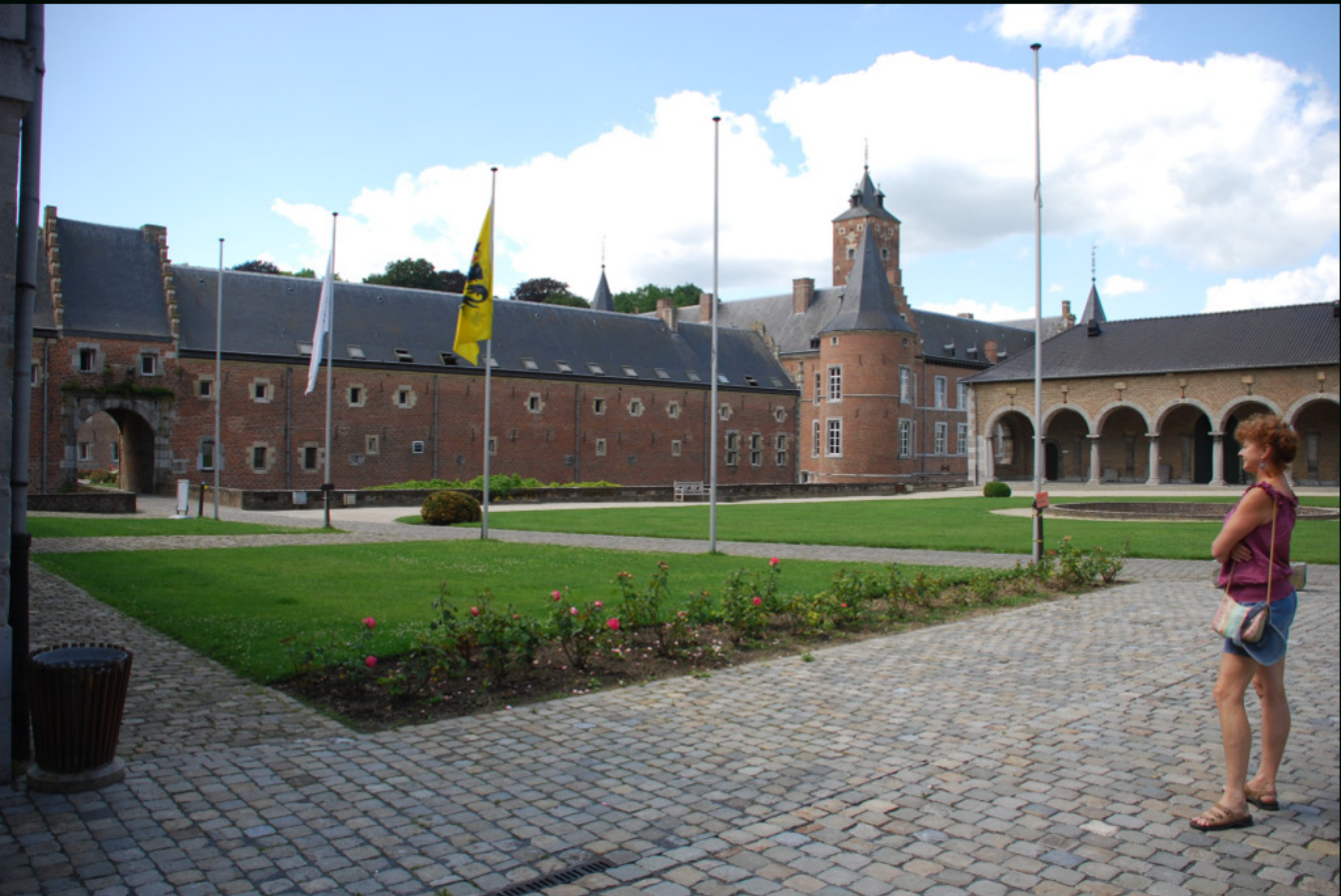
Inside the first of two large courtyards