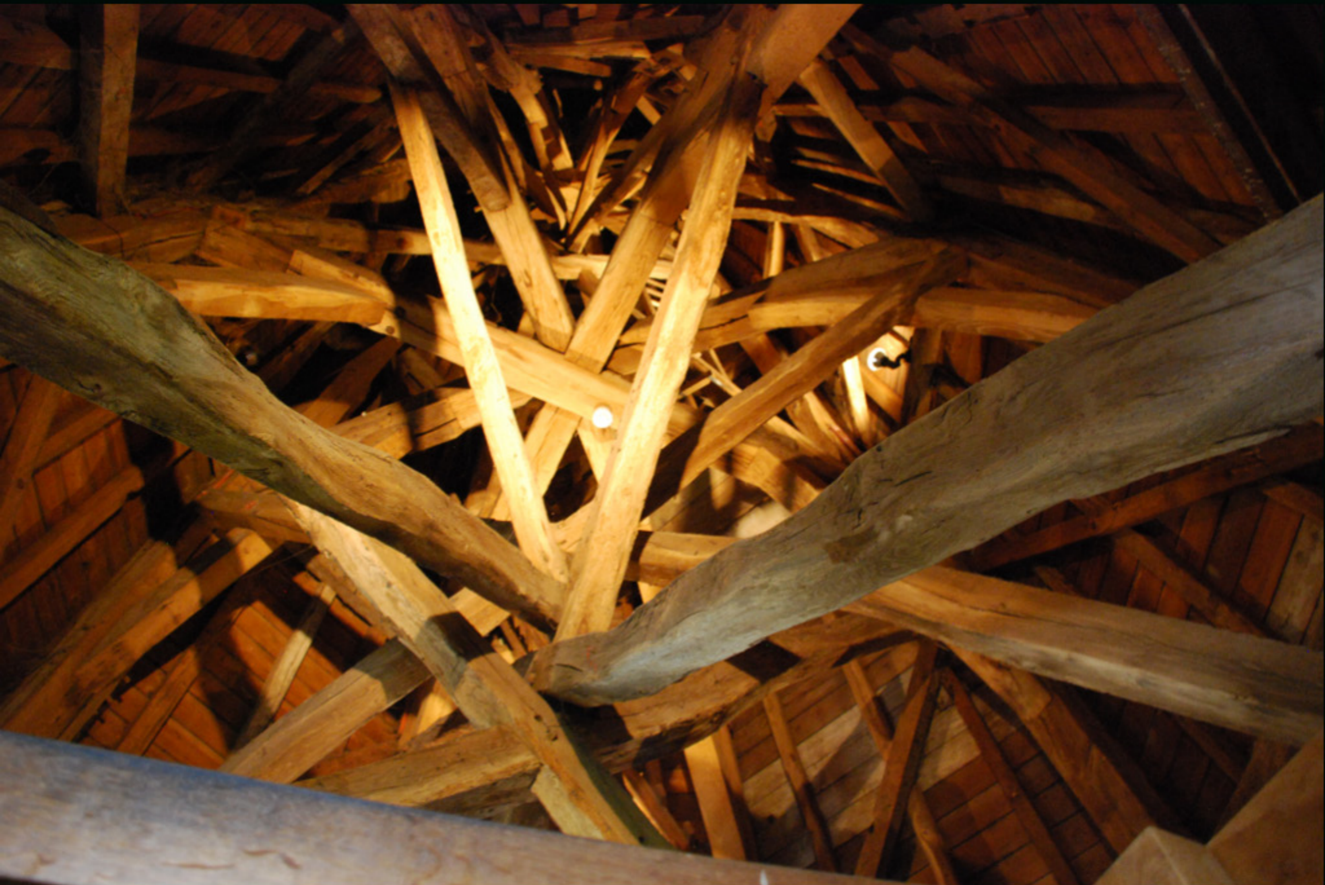
The interior views as well.