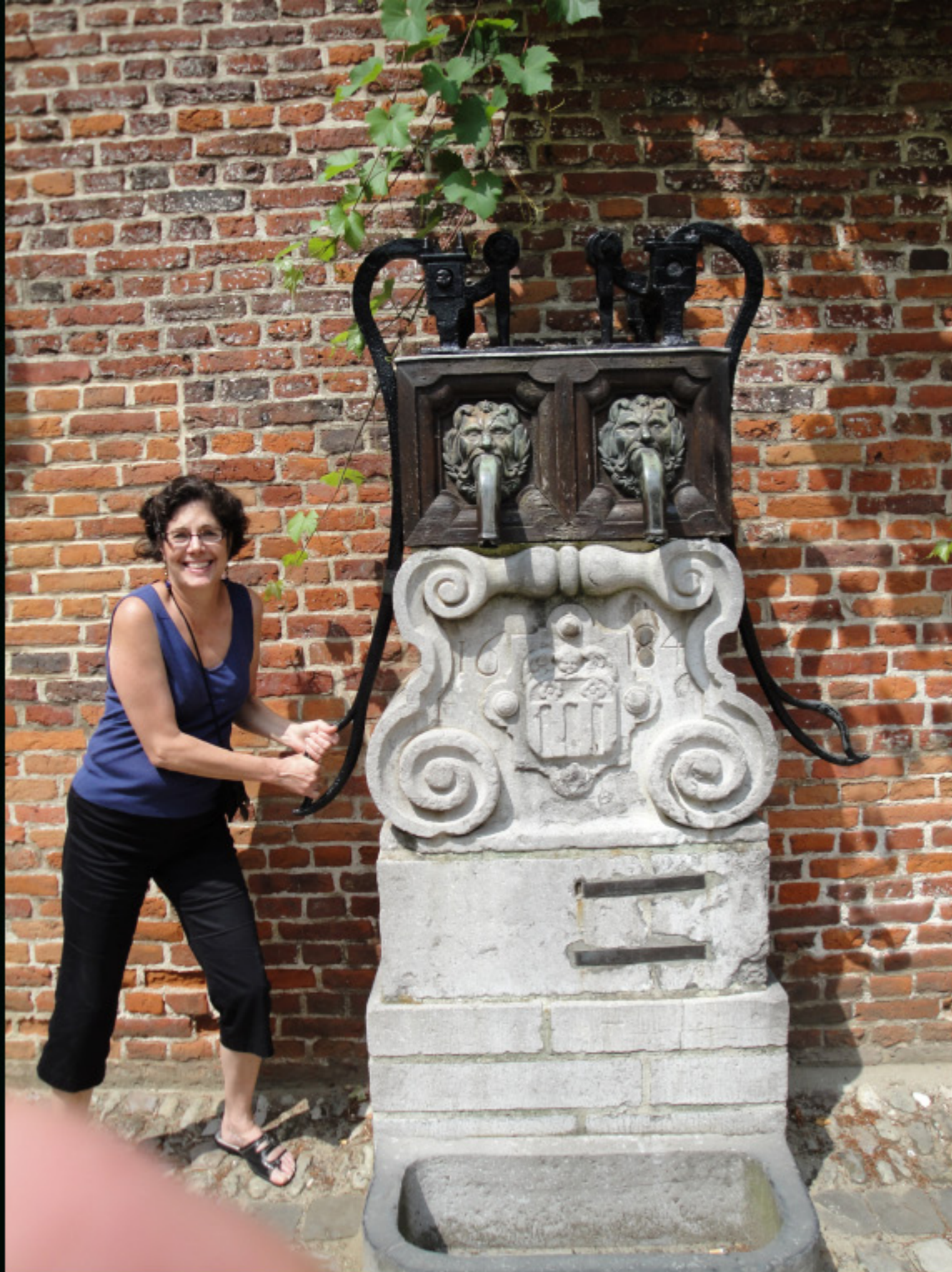
The Beguine community well from 1684