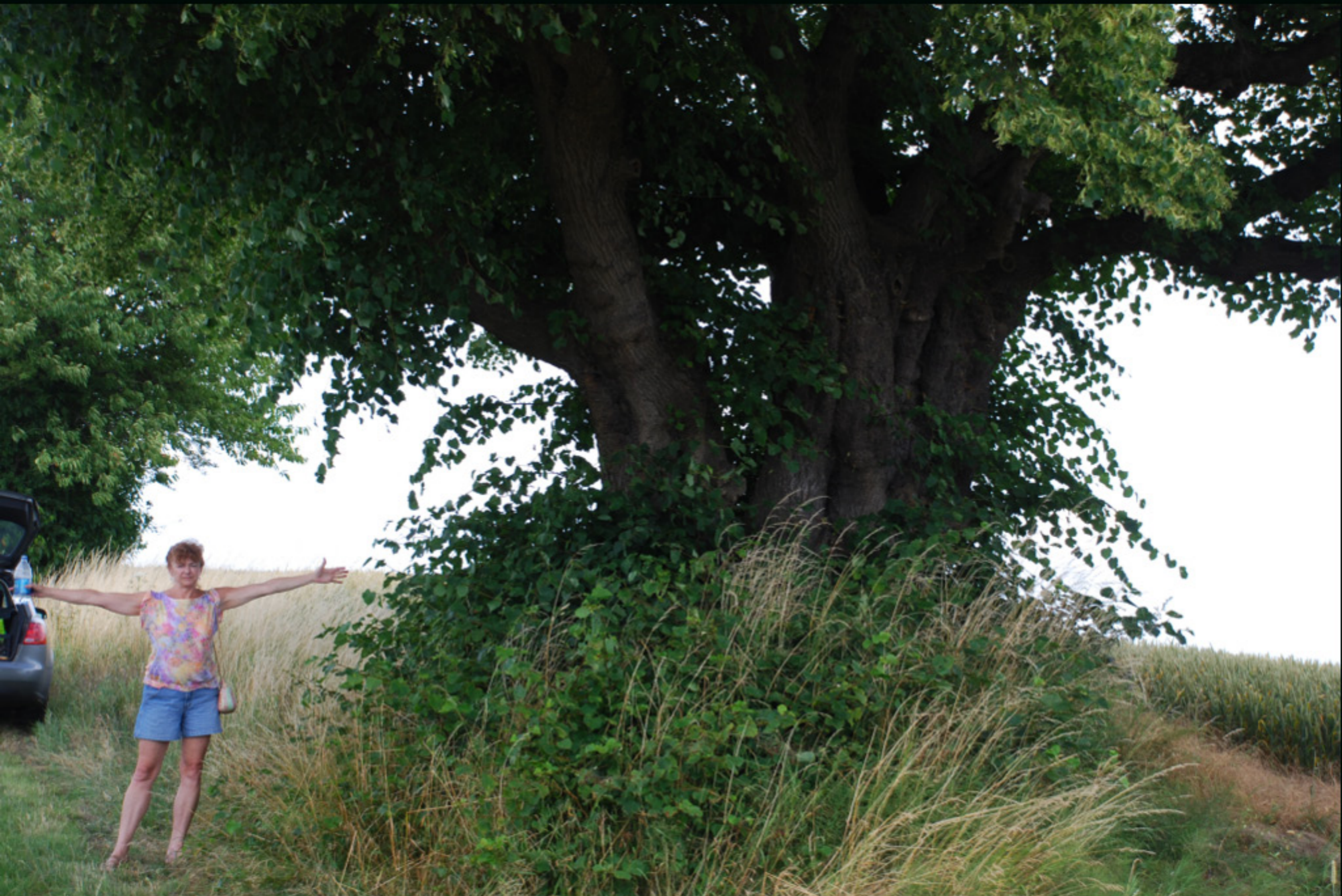
A picnic at the foot of this ancient linden tree...