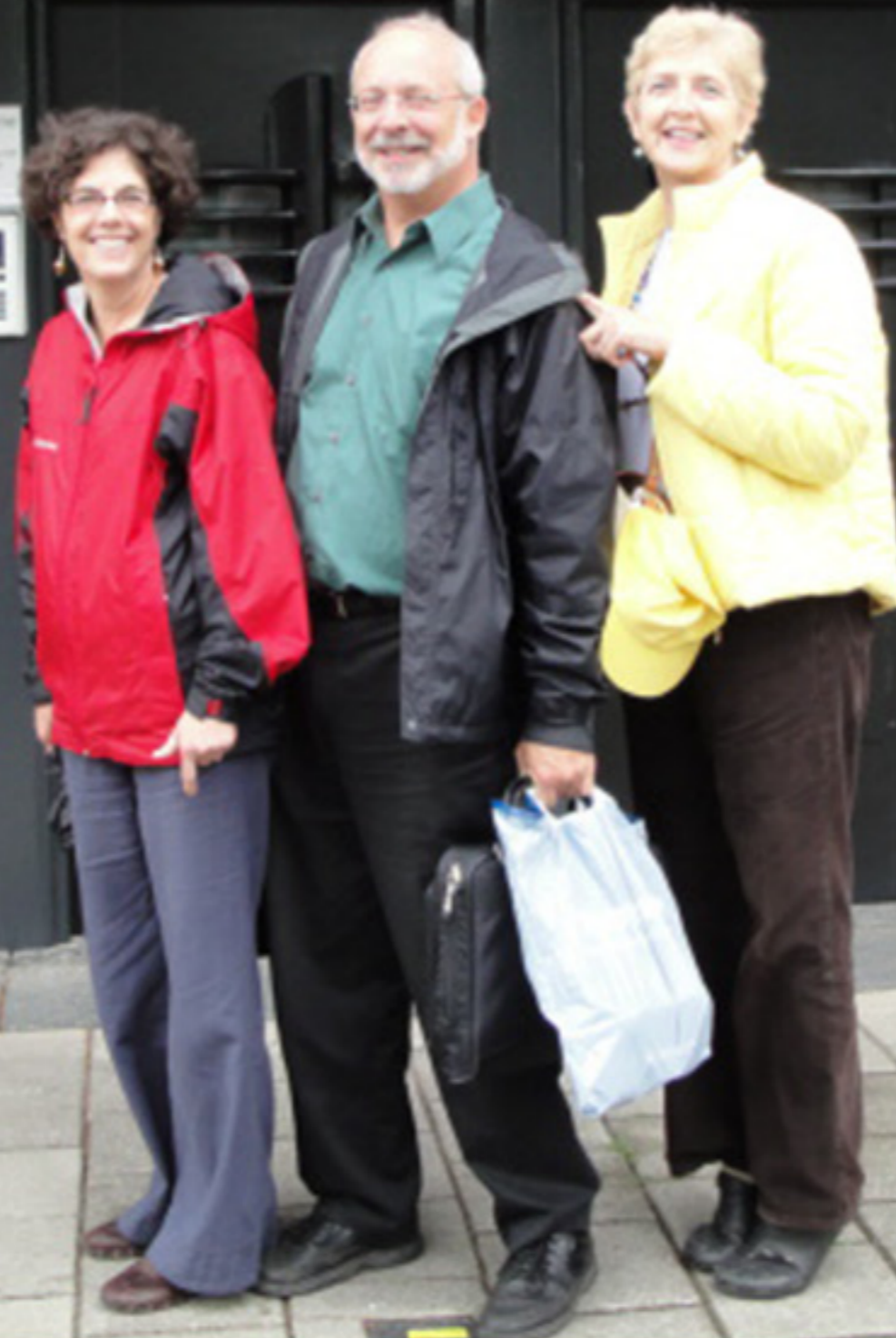
Buff's hardy companions