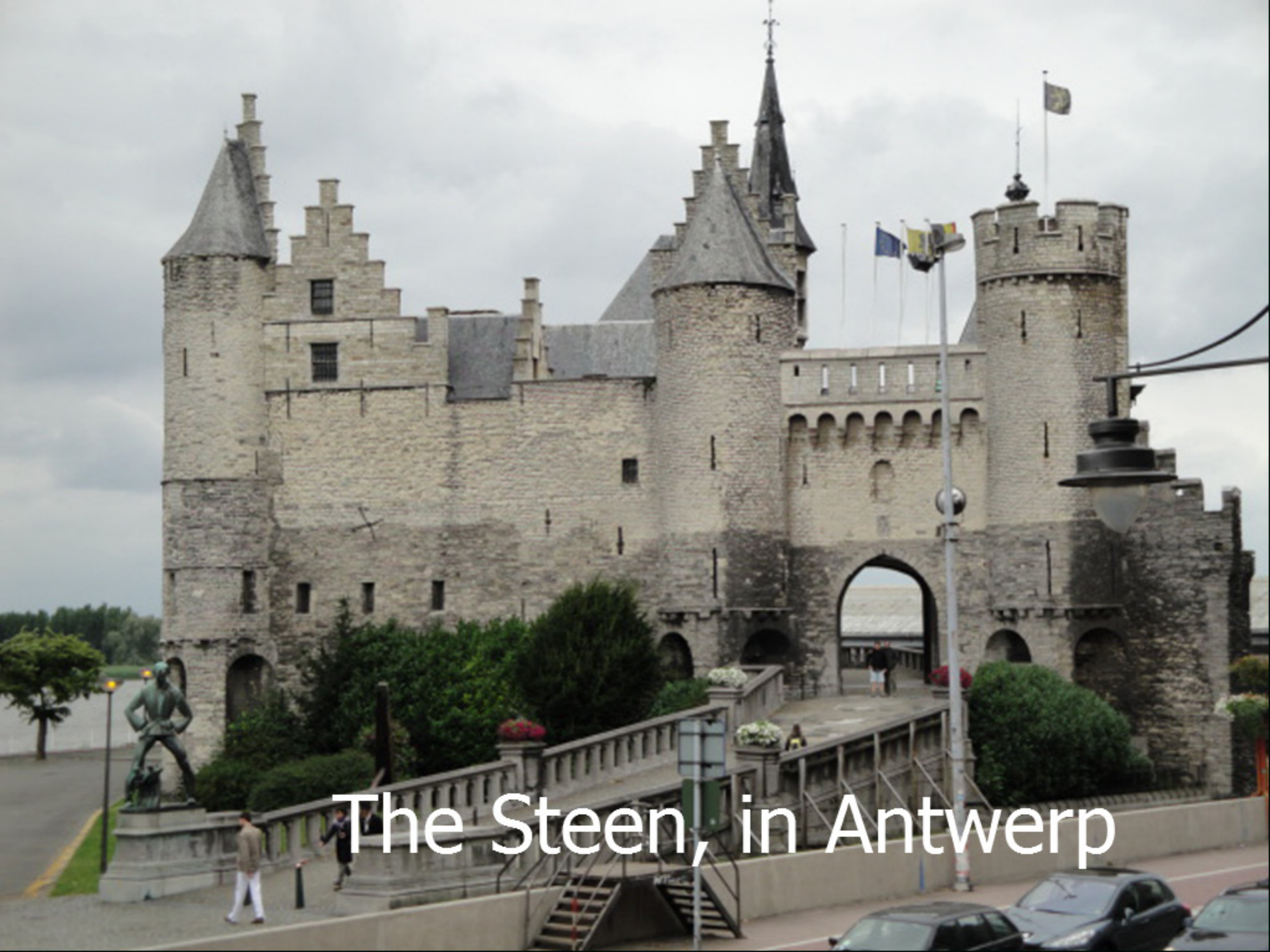
The Steen, in Antwerp