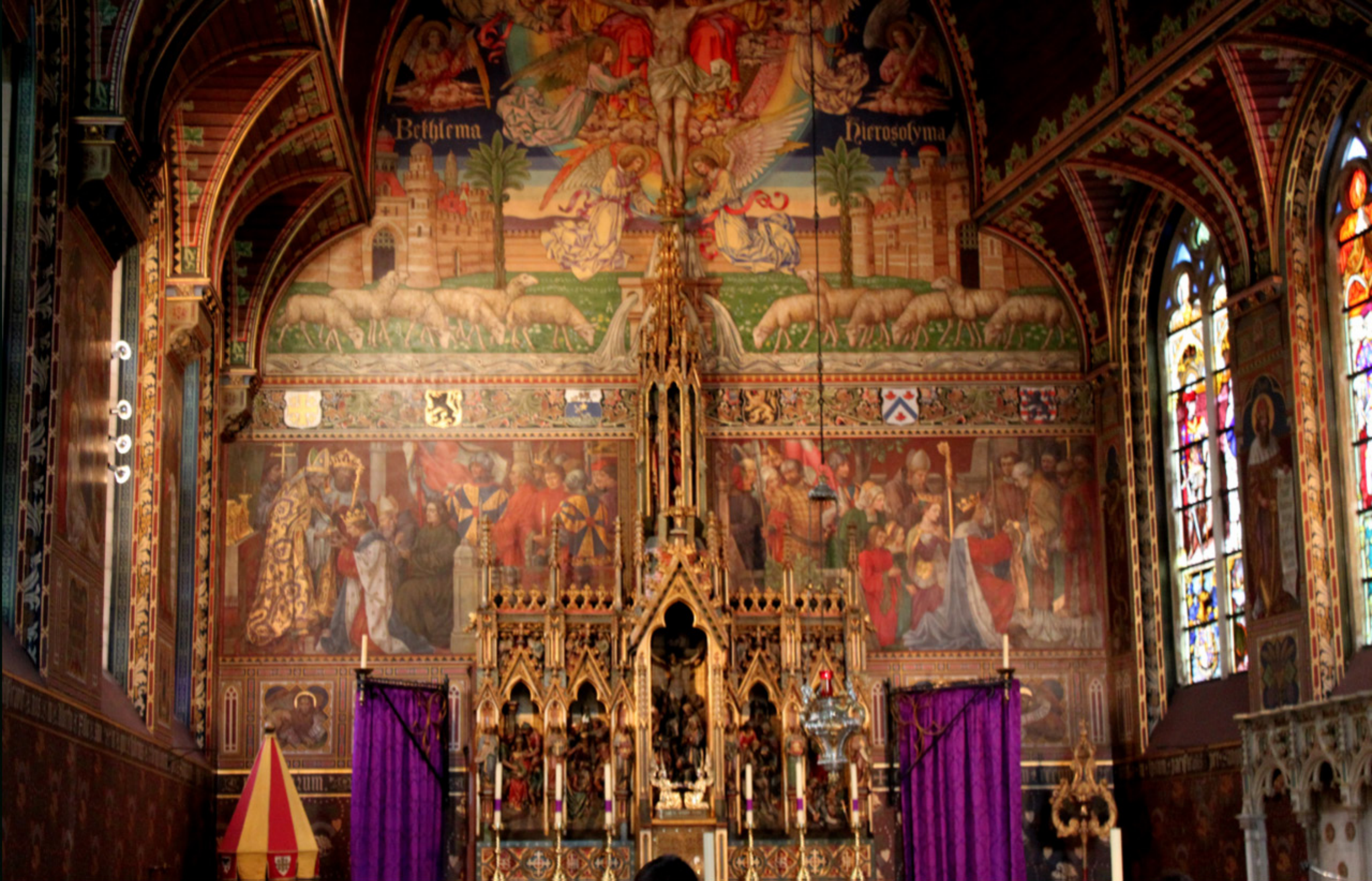
Inside the Church of the Holy Blood