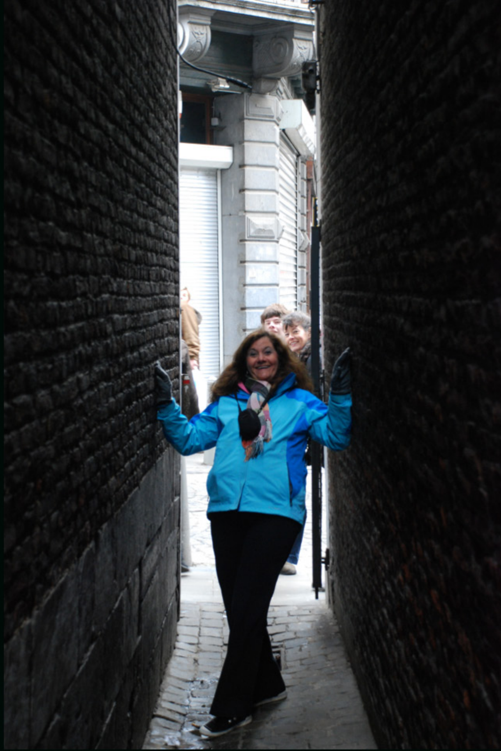
Rue de Carre, smallest street in Liege