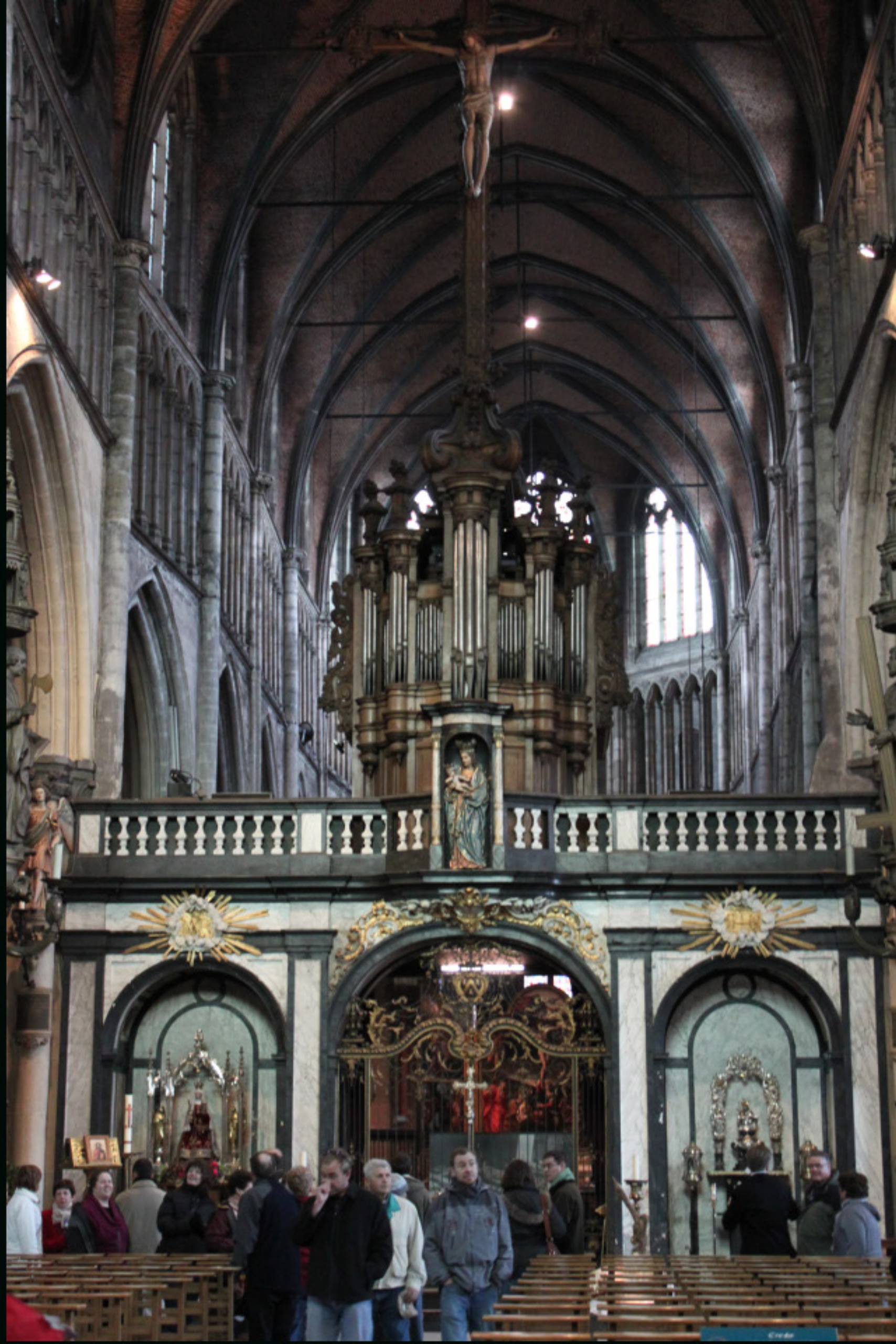
In the Church of Our Lady