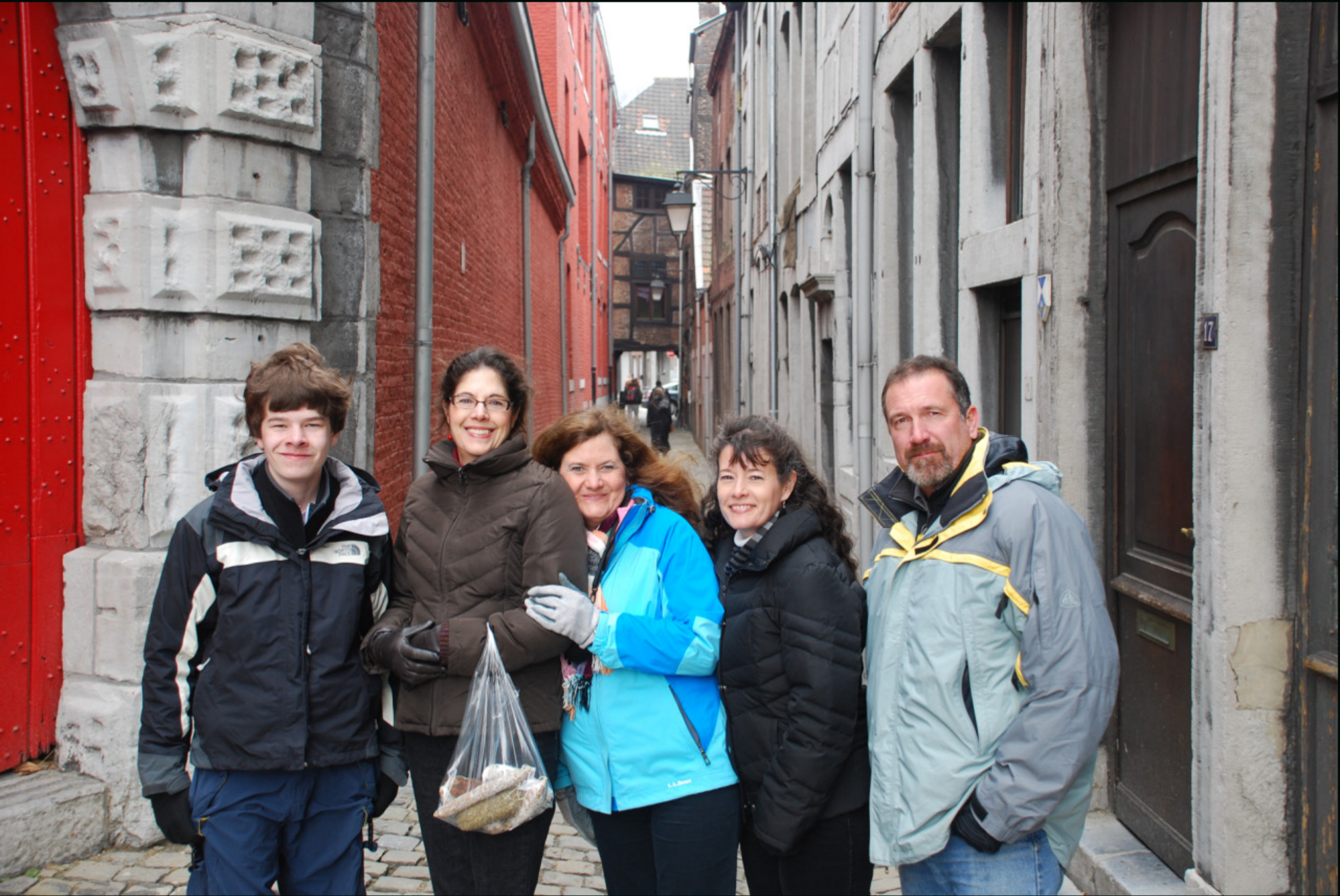
In the narrow streets of Liege