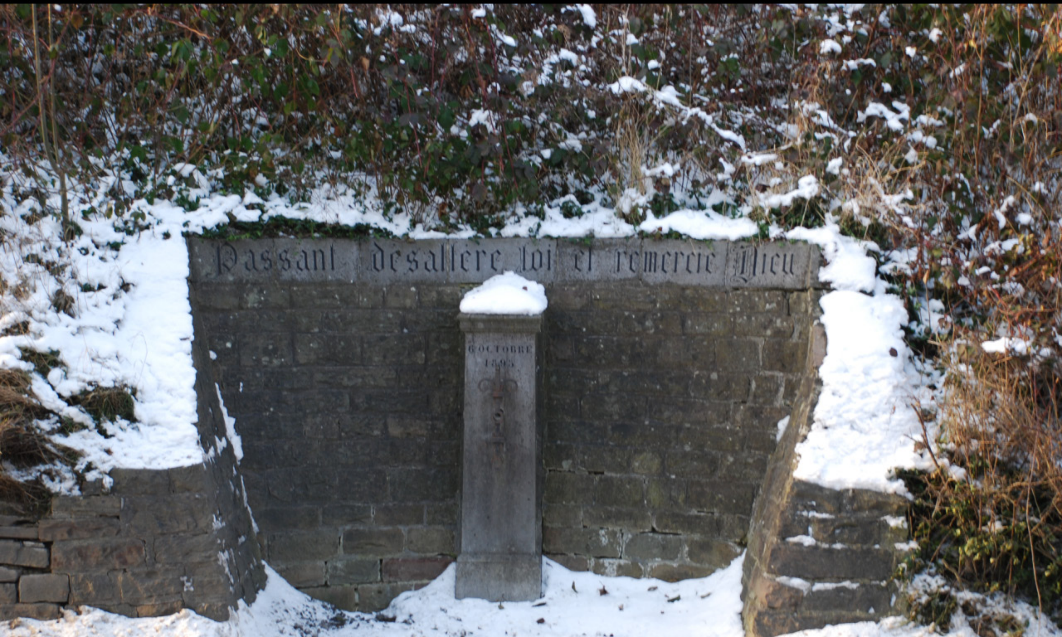
This fountain is right across from our front door