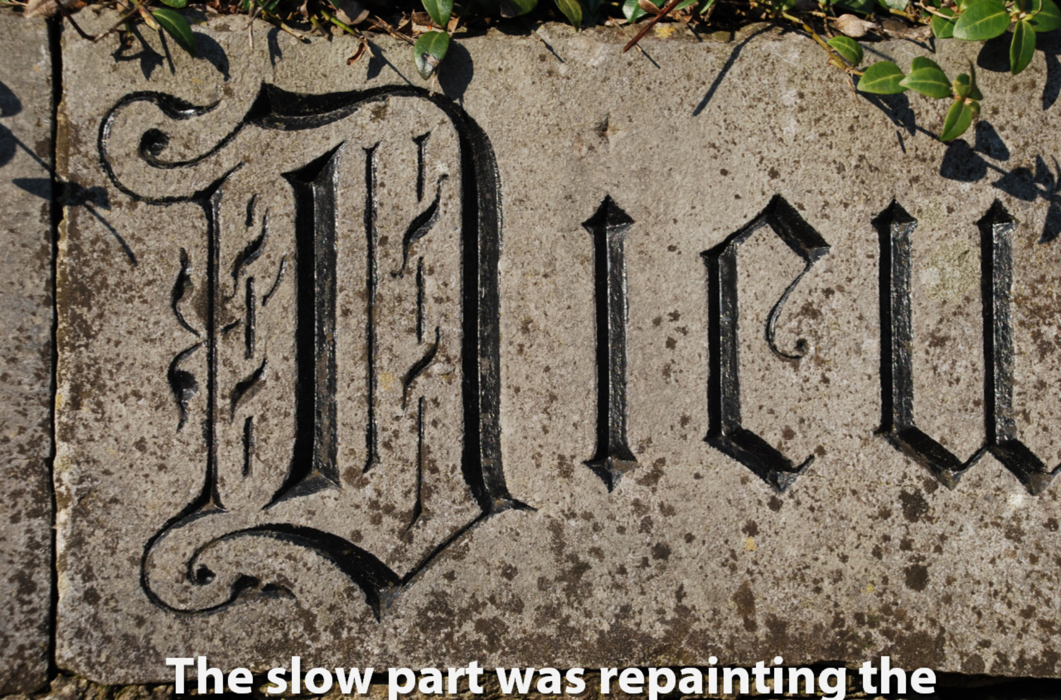
The slow part was repainting the carved lettering