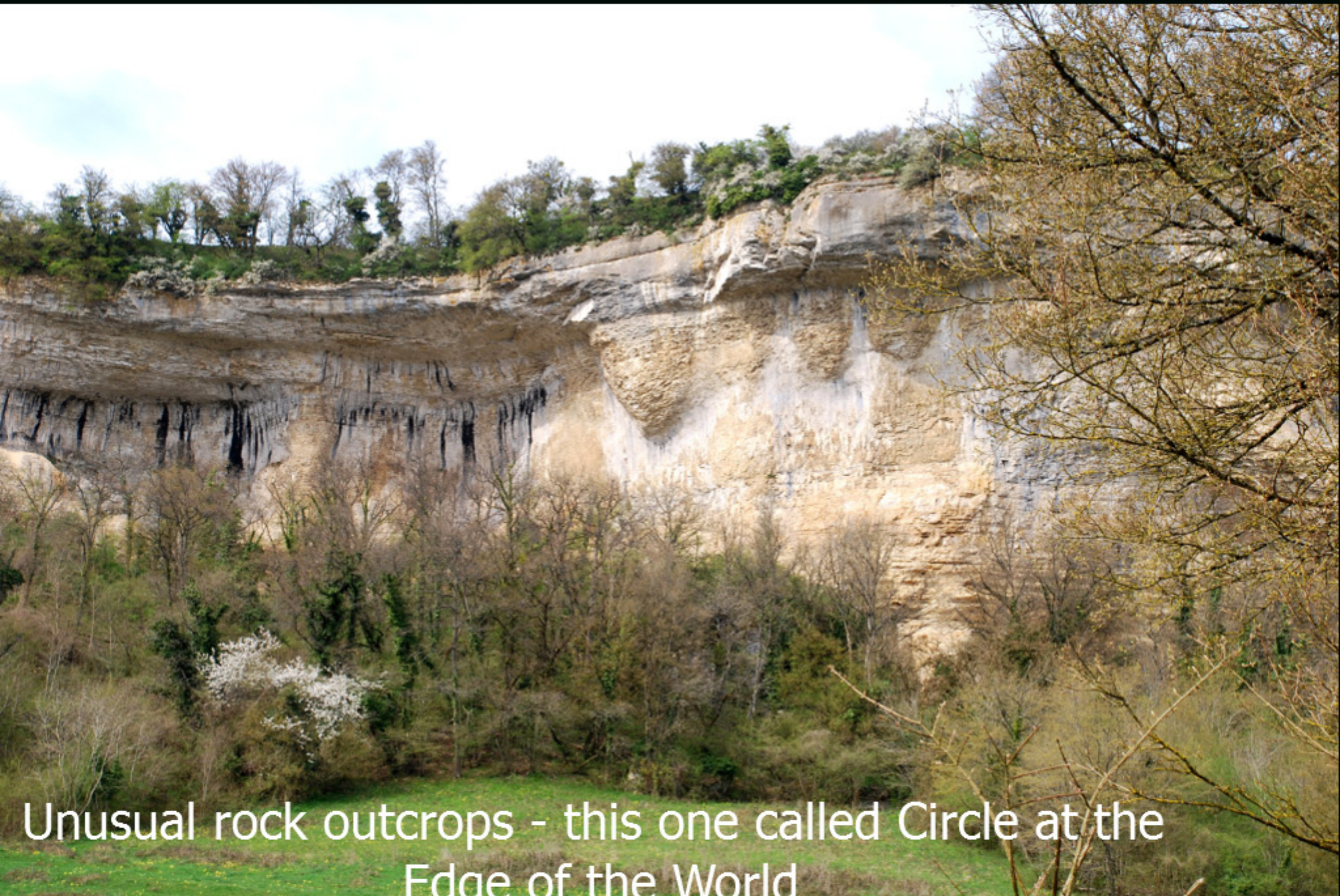
Unusual rock outcrops - this one called Circle at the Edge of the World