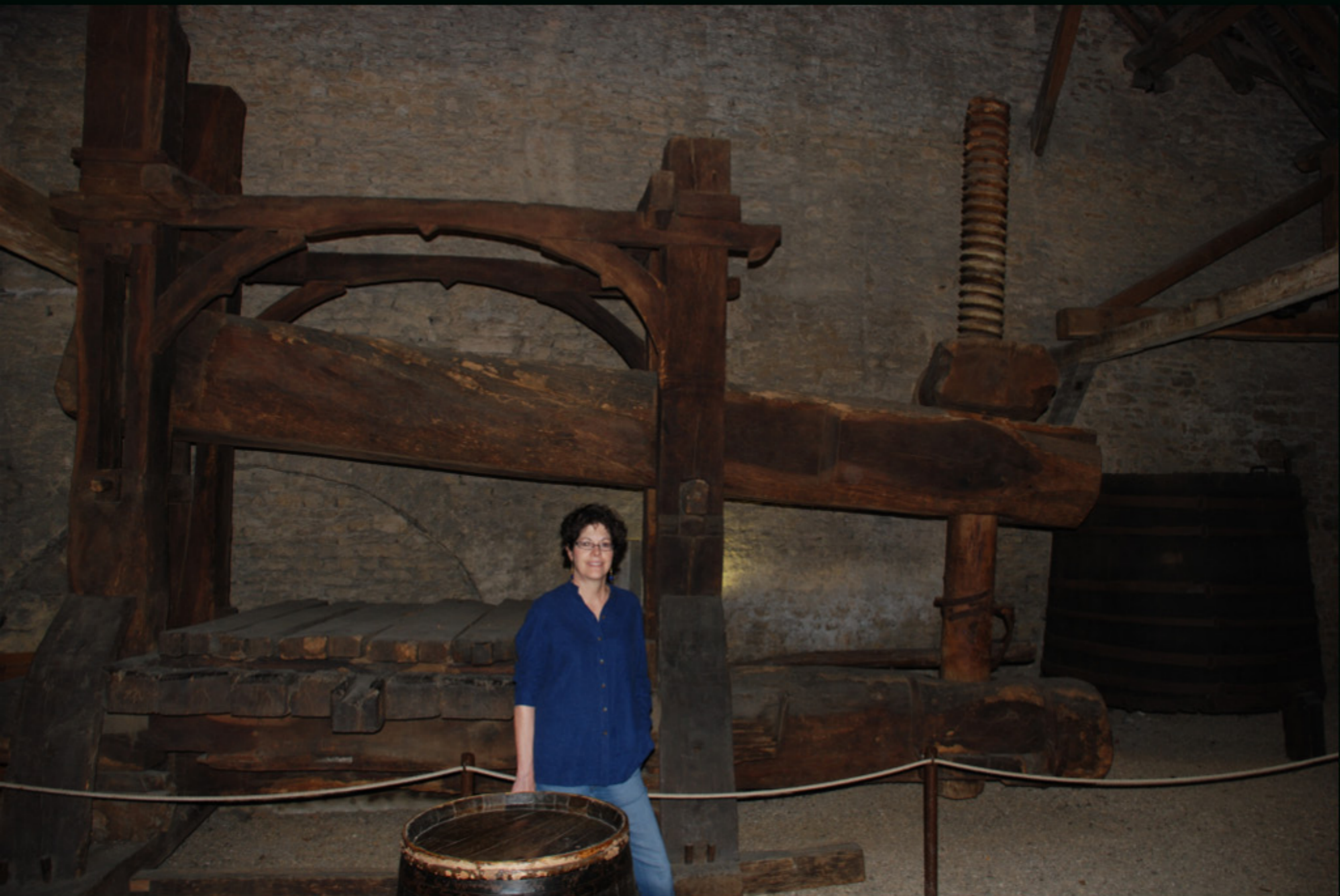
An 18th century wine press