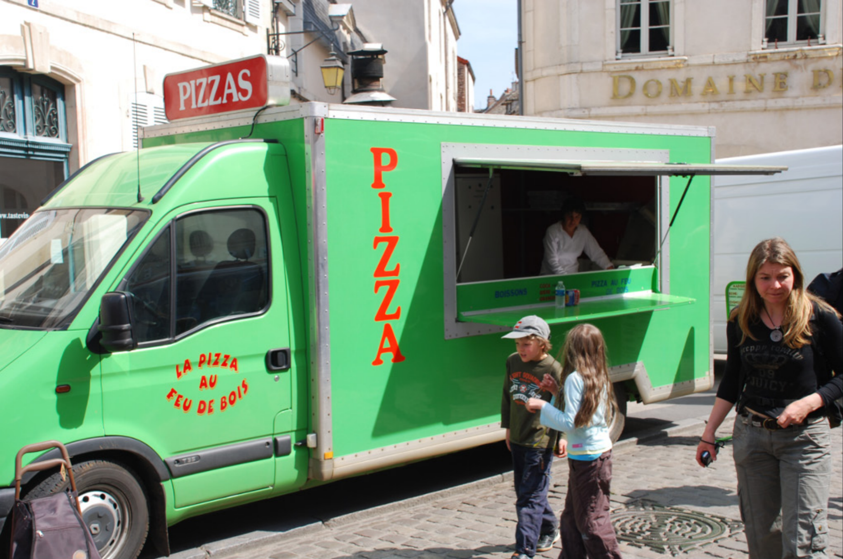
At the market in Beaune, a wood-fired pizza wagon