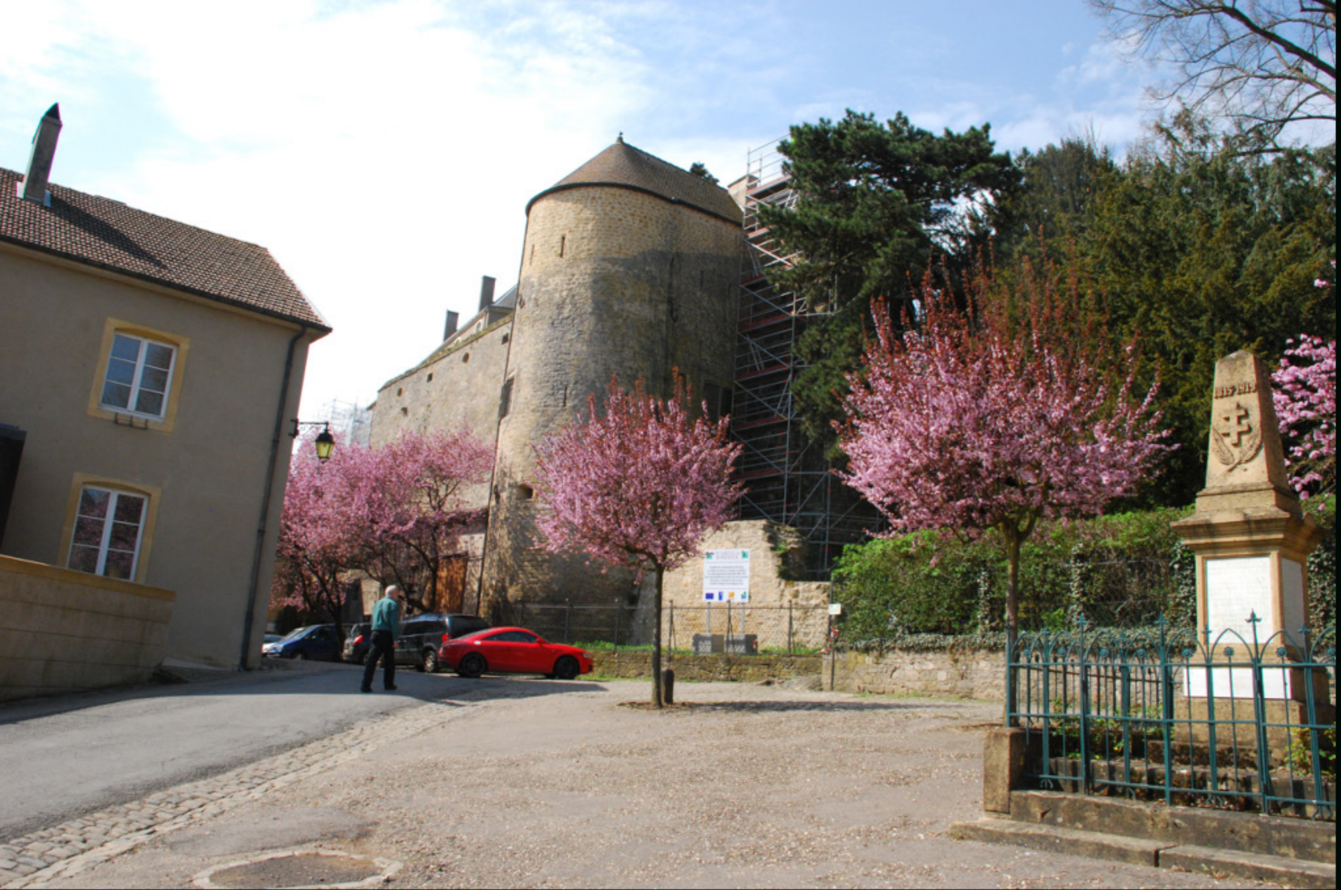
The first of several walled villages on the trip: Rodemack