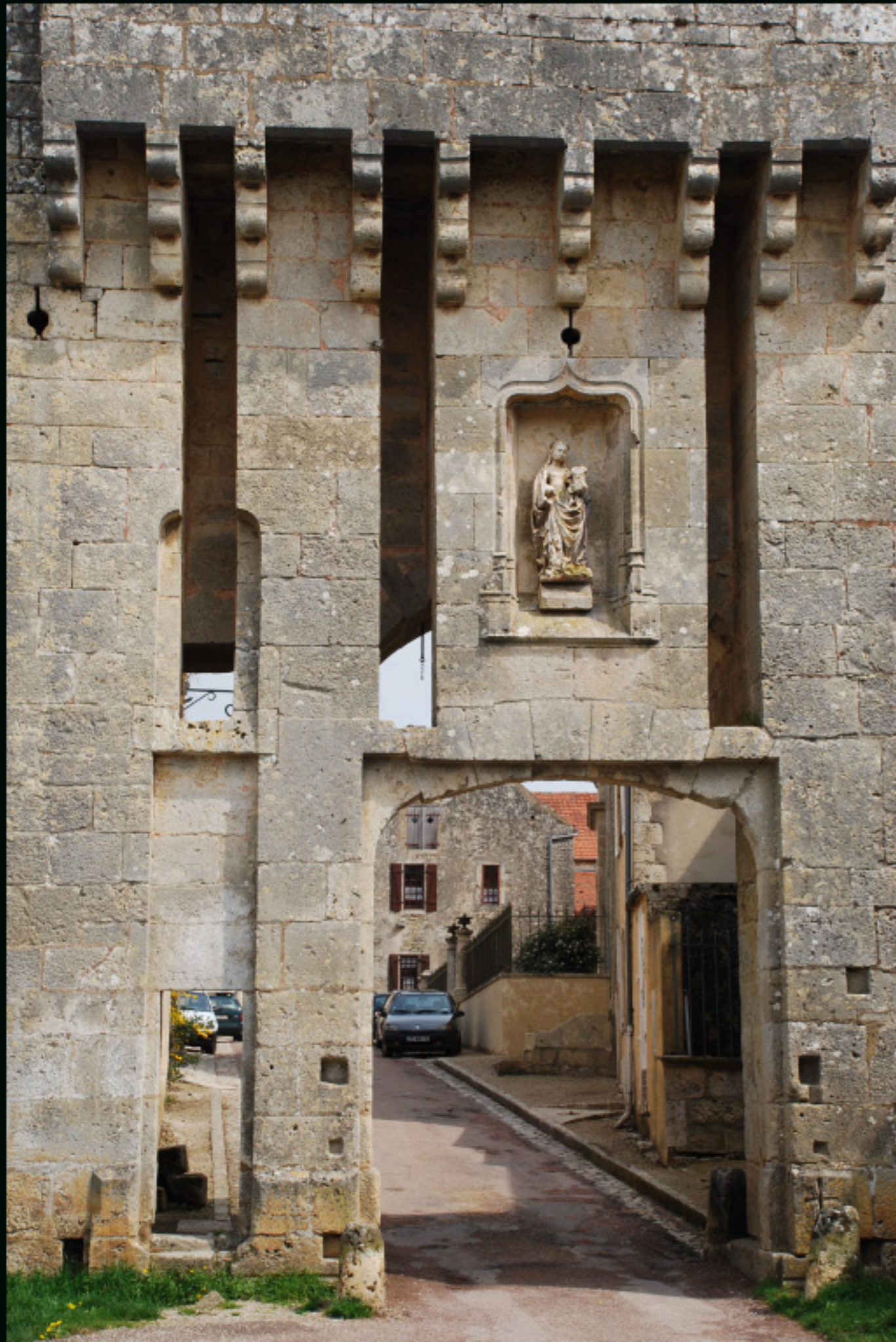
A gate into Flavigny-sur-Ozerain