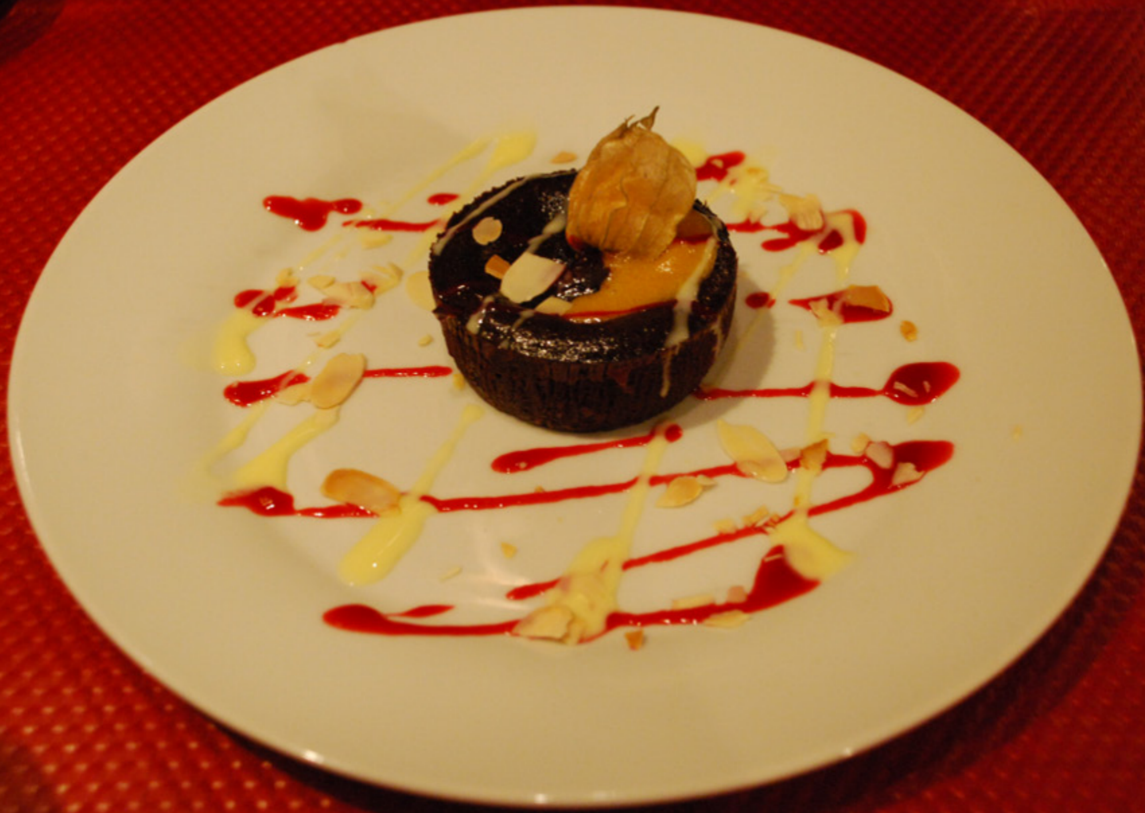
With birthday cake!