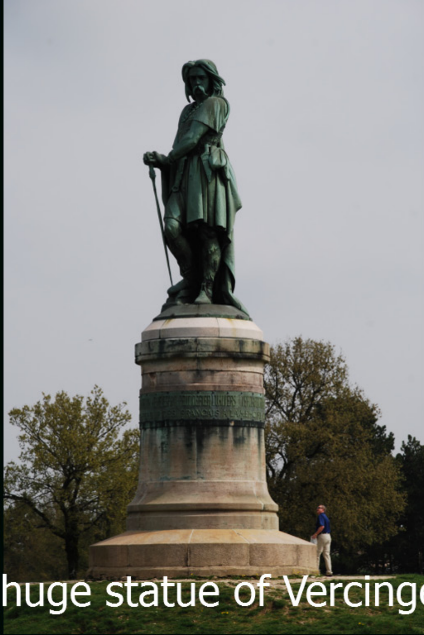
The huge statue of Vercingetorix