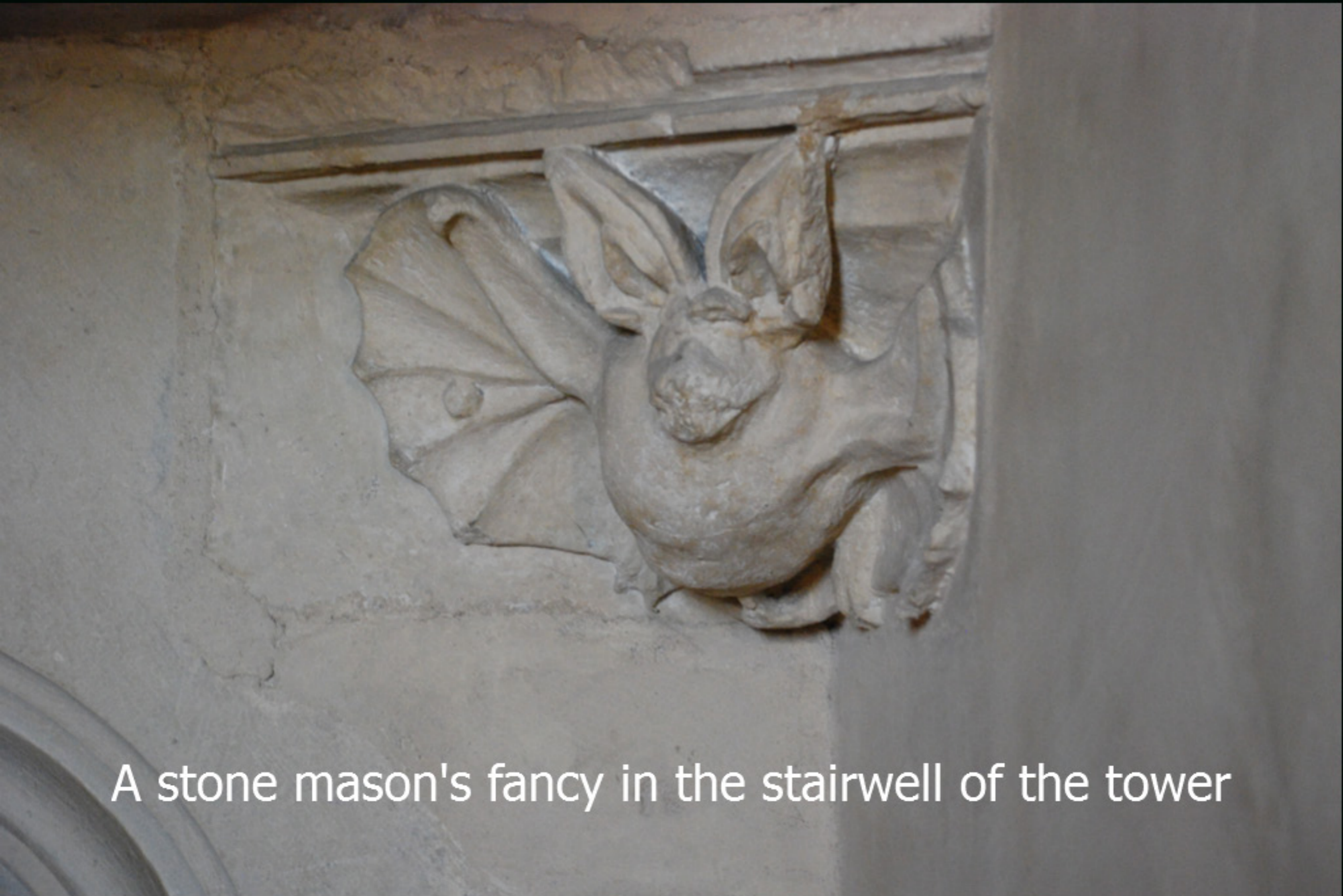
A stone mason's fancy in the stairwell of the tower