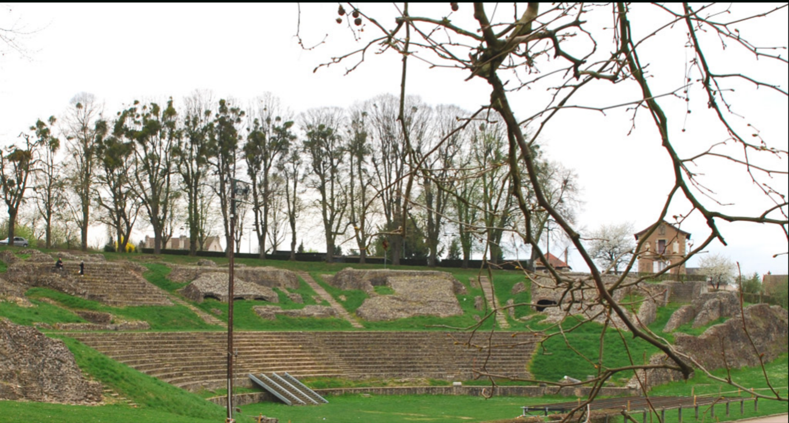
Remains of a Roman amphitheater