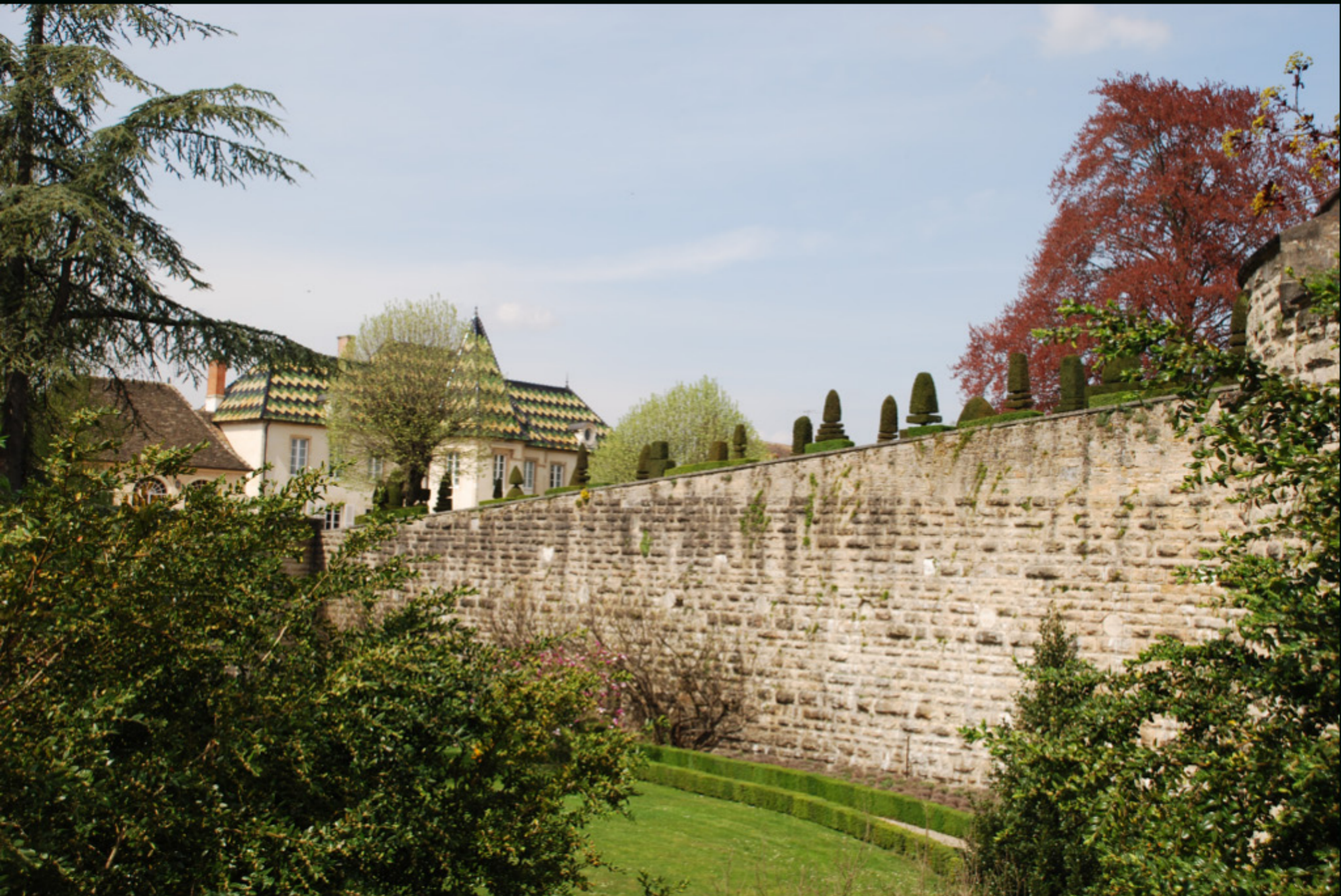
A chateau within the city walls of Beaune