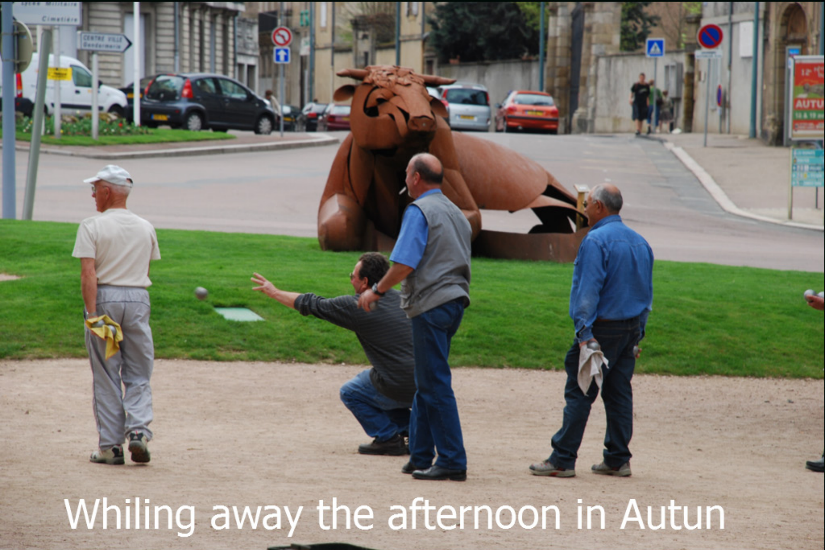
Whiling away the afternoon in Autun