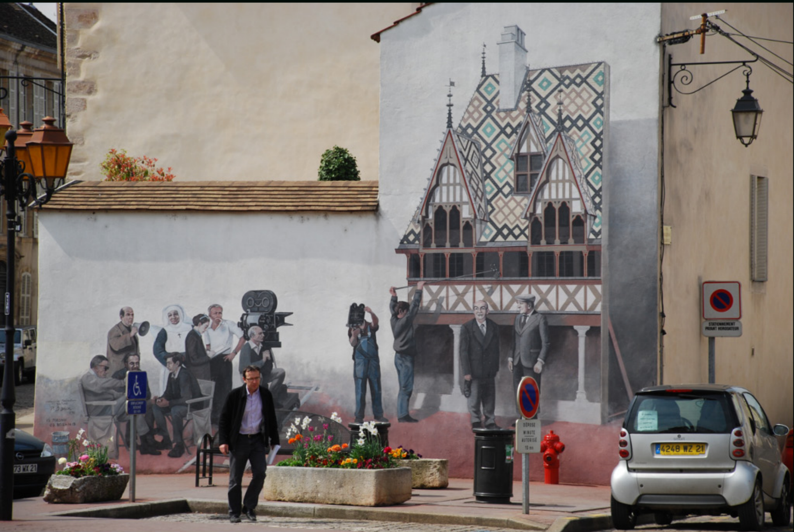
This mural commemorates a movie made here in the 30's