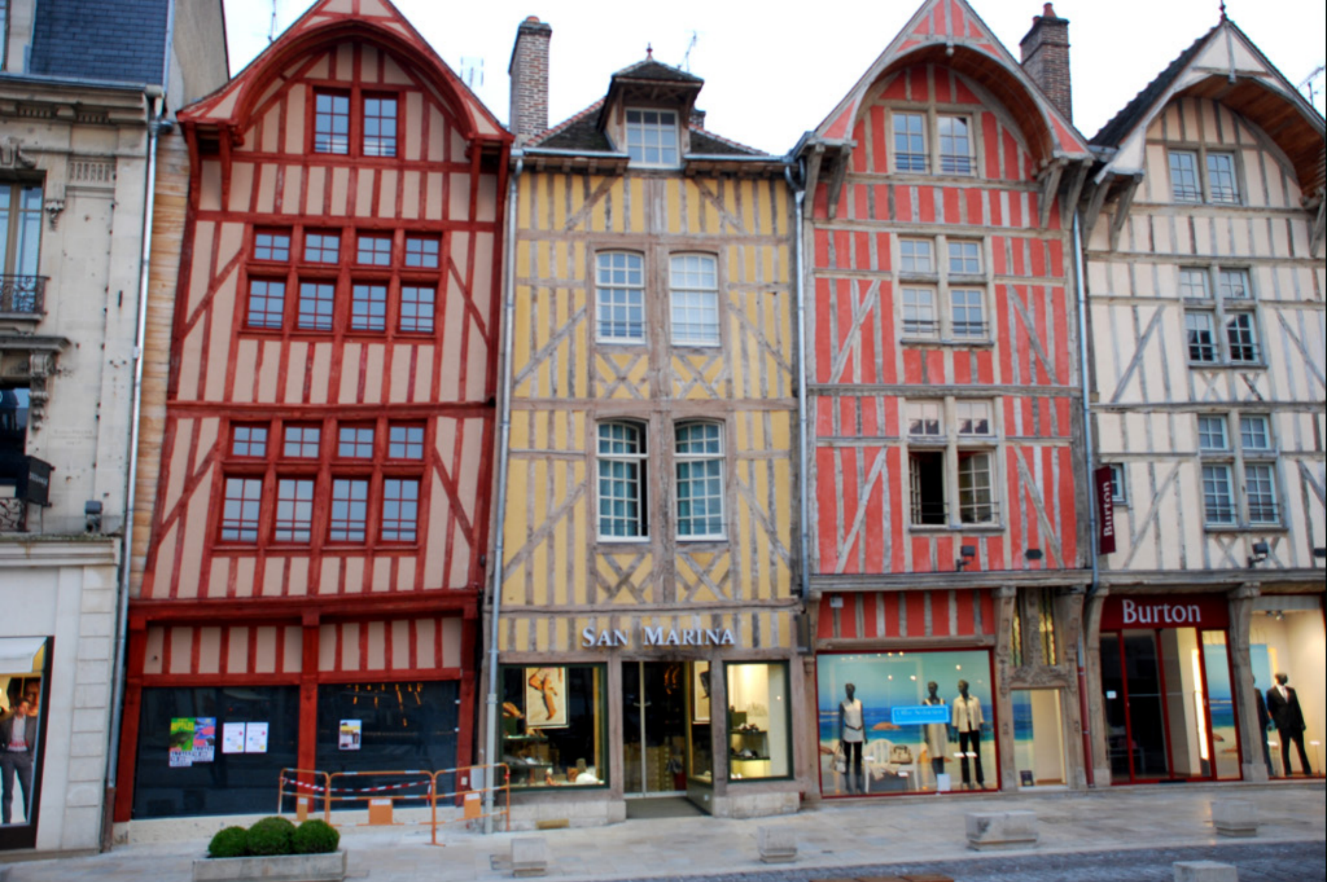
Decked out in local colors, Troyes' timber-frames go upscale