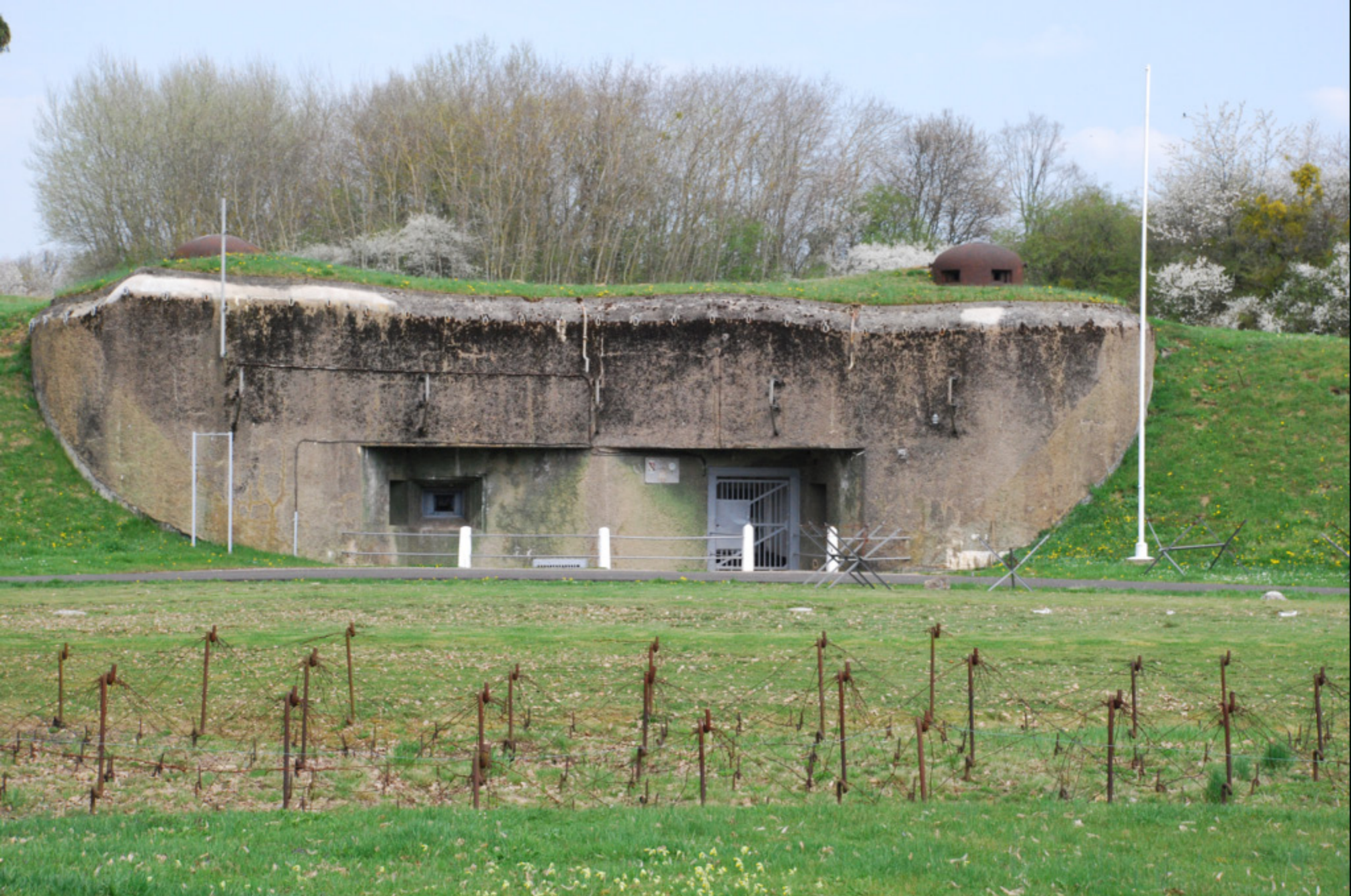
We enter France and see part of its pre-WWII folly, the Maginot Line