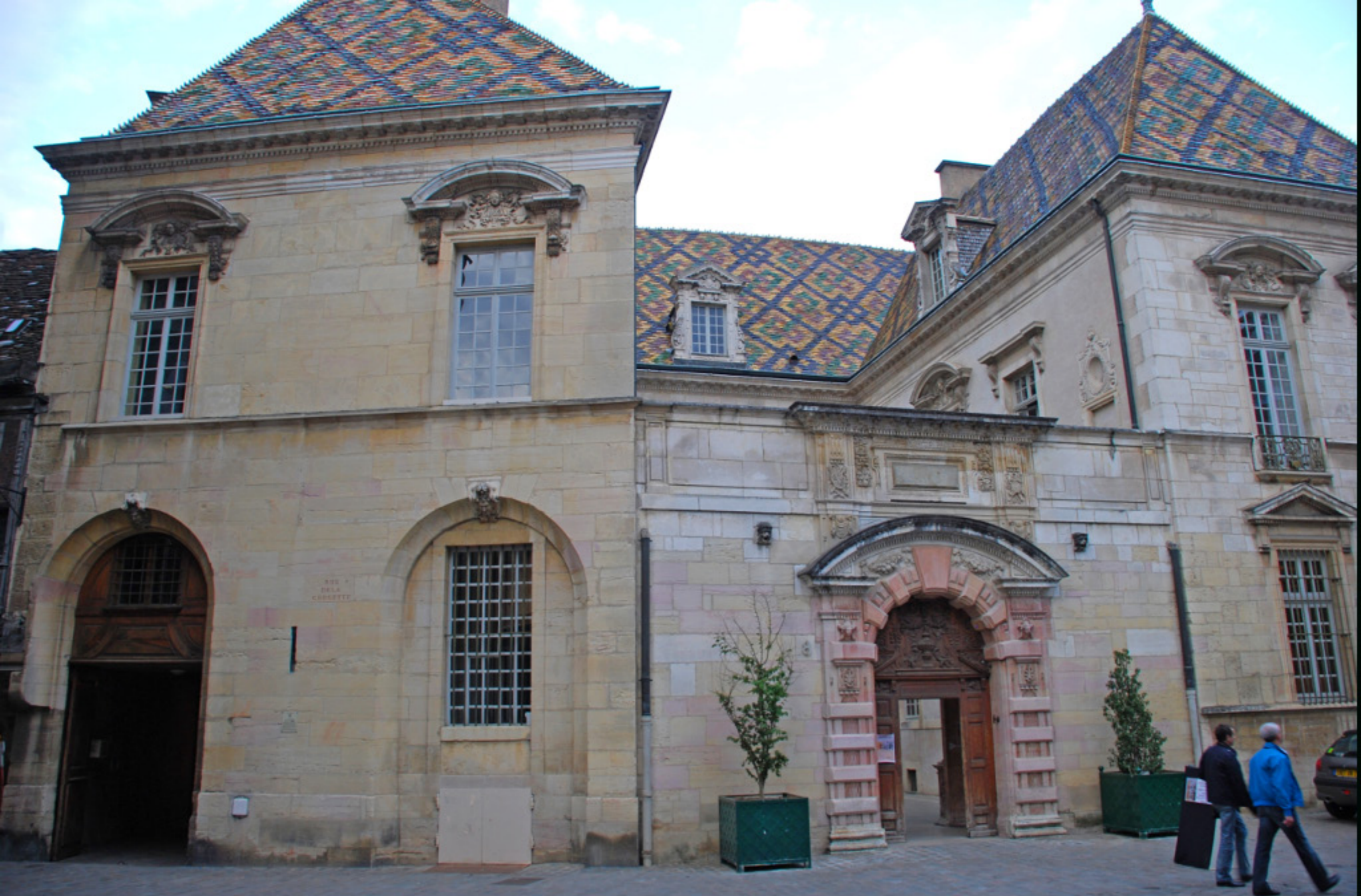
The town house of a noble family The glazed tile roofs are common in the area