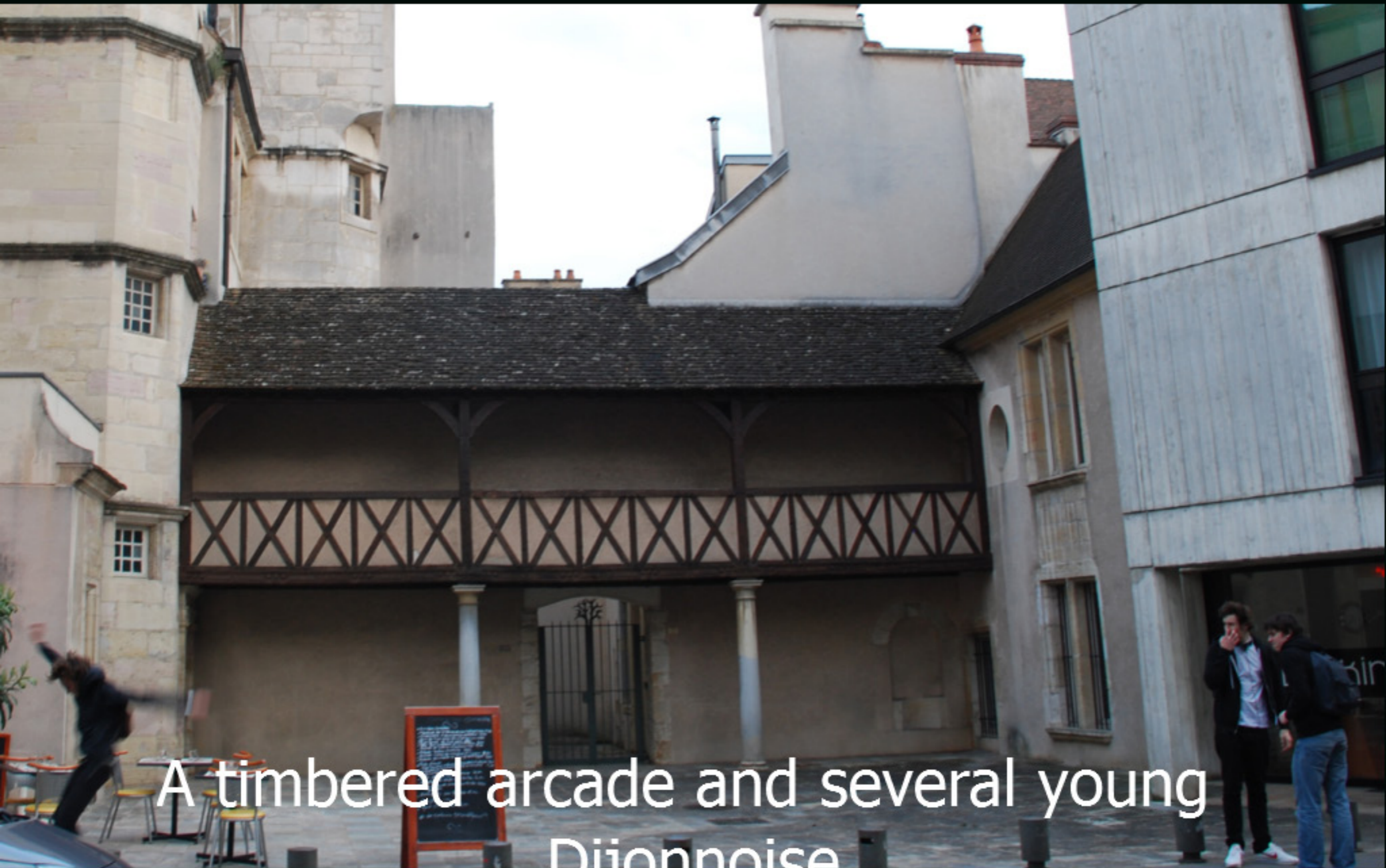
A timbered arcade and several young Dijonnoise