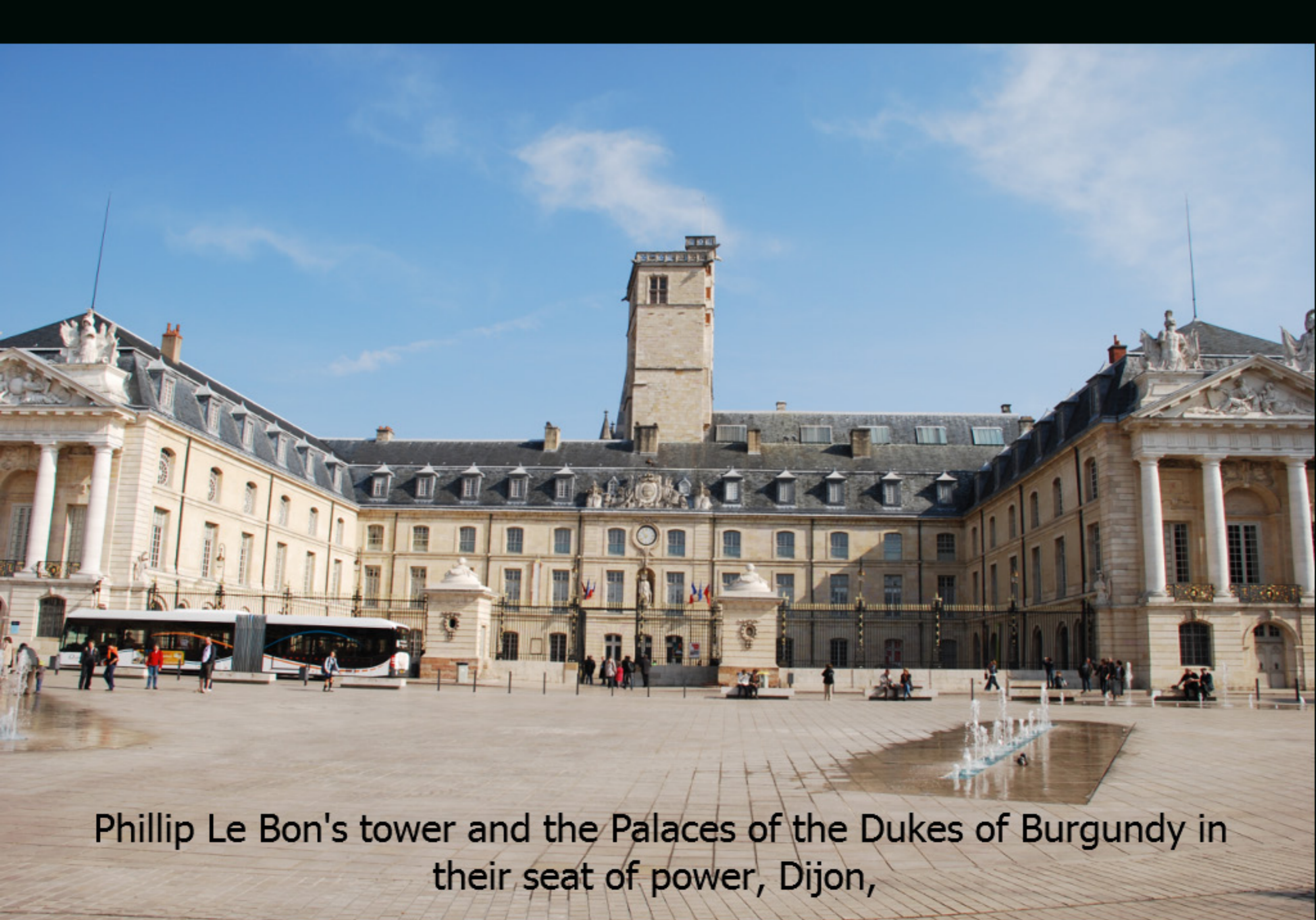
Phillip Le Bon's tower and the Palaces of the Dukes of Burgundy in their seat of power, Dijon,